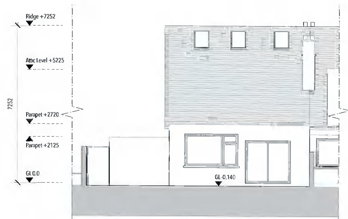
2 Existing Rear Elevation Scale: 1:100