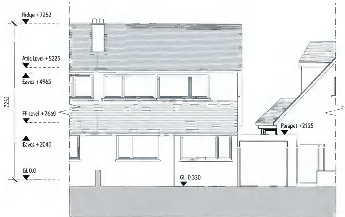
1 Existing Front Elevation Scale: 1:100