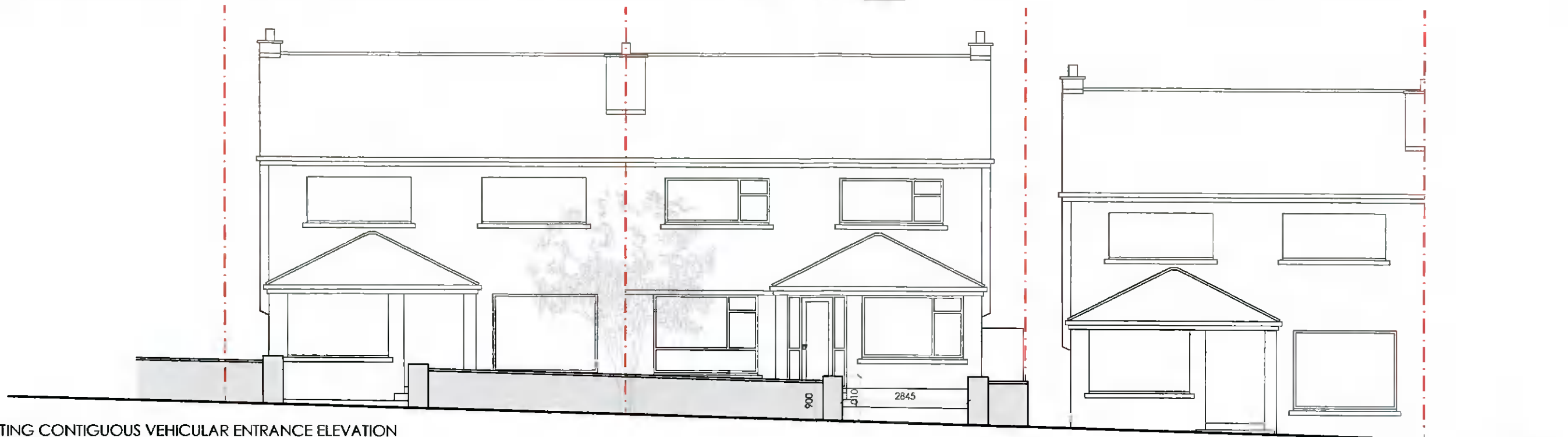
EXISTING CONTIGUOUS VEHICULAR ENTRANCE ELEVATION scale 1:100 @ A3