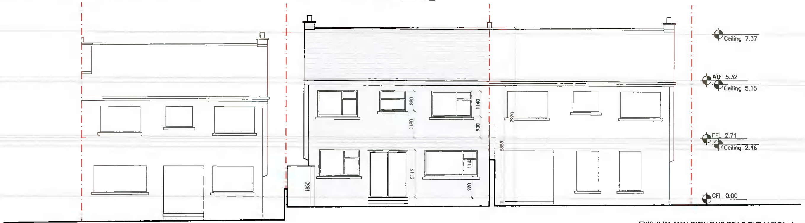
EXISTING CONTIGUOUS REAR ELEVATION [northwest] scale 1:100 @ A3