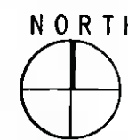
PROPOSED SITE LAYOUT MAP | LICENCE NO: 50253800 scale 1:250 @ A3