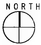
EXISTING SITE LAYOUT MAP | LICENCE NO: 50253800 scale 1:250 @ A3

All new and existing foul drainage to new final A.J and away to existing systems, subject to site investigation and in accordance with local authority All new surface drainage to new soakaway, to BRE365 to engineer spec, subject to site investigation