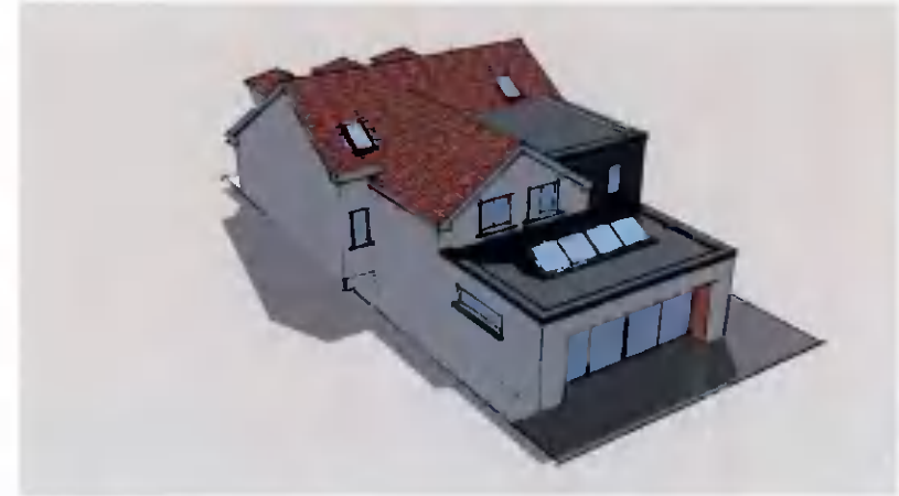
Proposed 3D Image #2 scale N/A