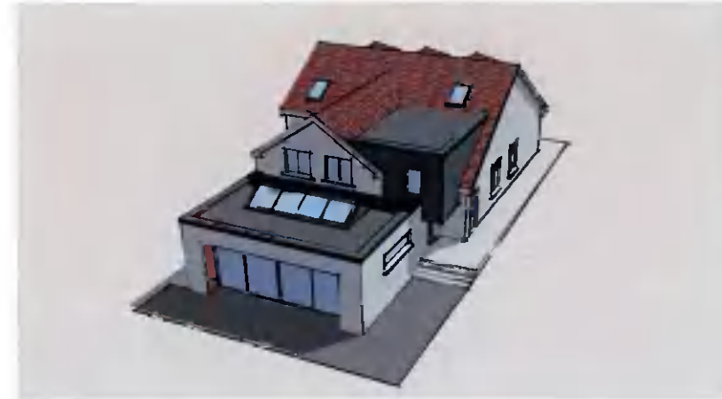
Proposed 3D Image #1 scale N/A