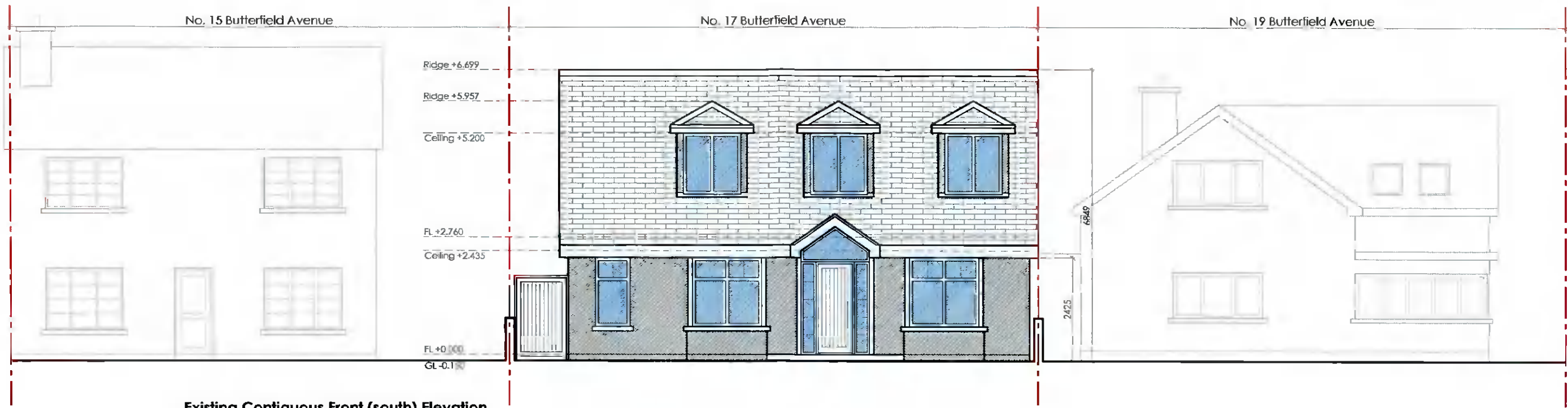
Existing Contiguous Front (south) Elevation scale 1:100 @ A3