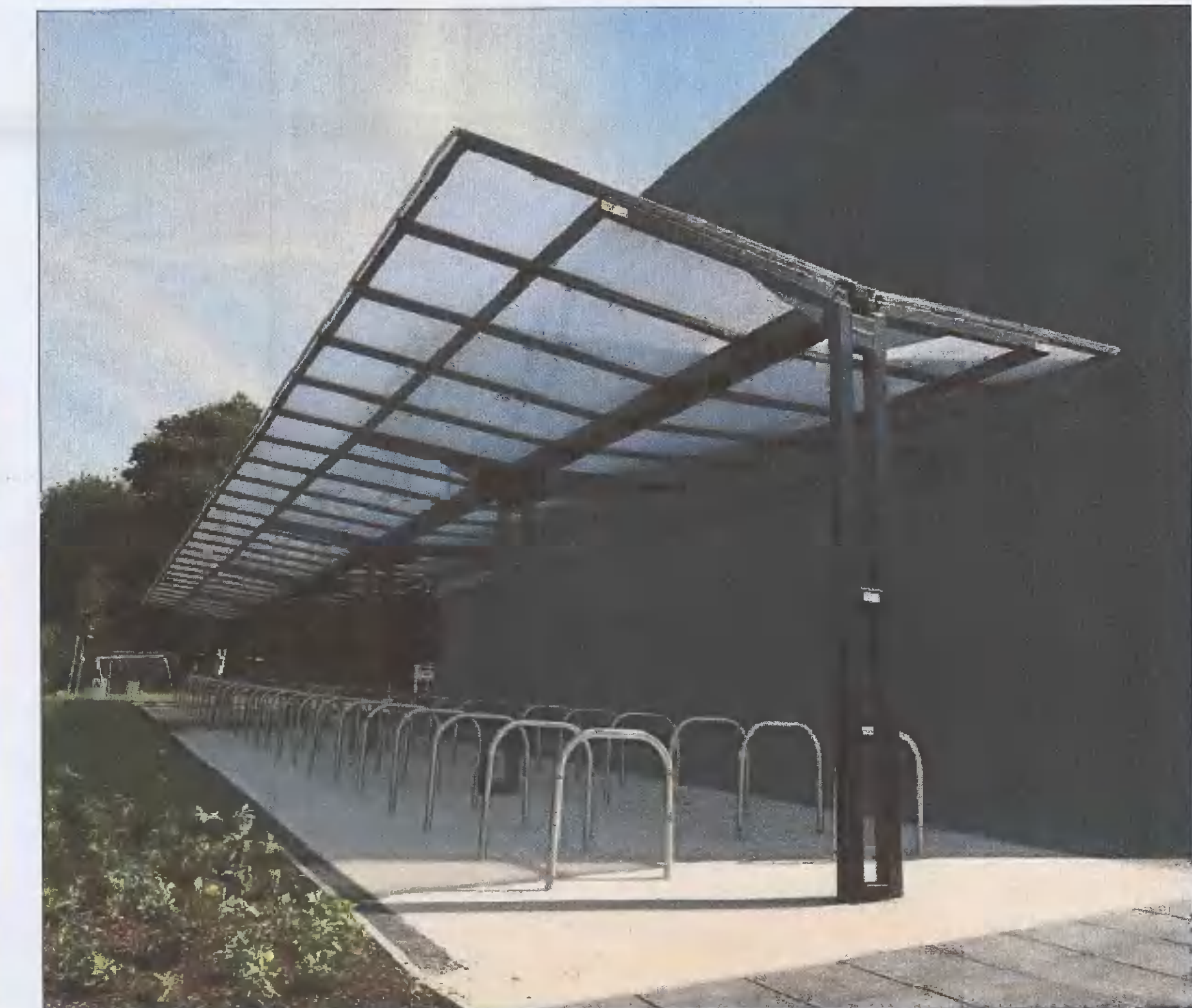
INDICATIVE IMAGE OF PROPOSED BICYCLE SHELTER

DO NOT SCALE USE FIGURED DIMENSIONS ONLY ALL DIMENSIONS TO BE CHECKED ON SITE