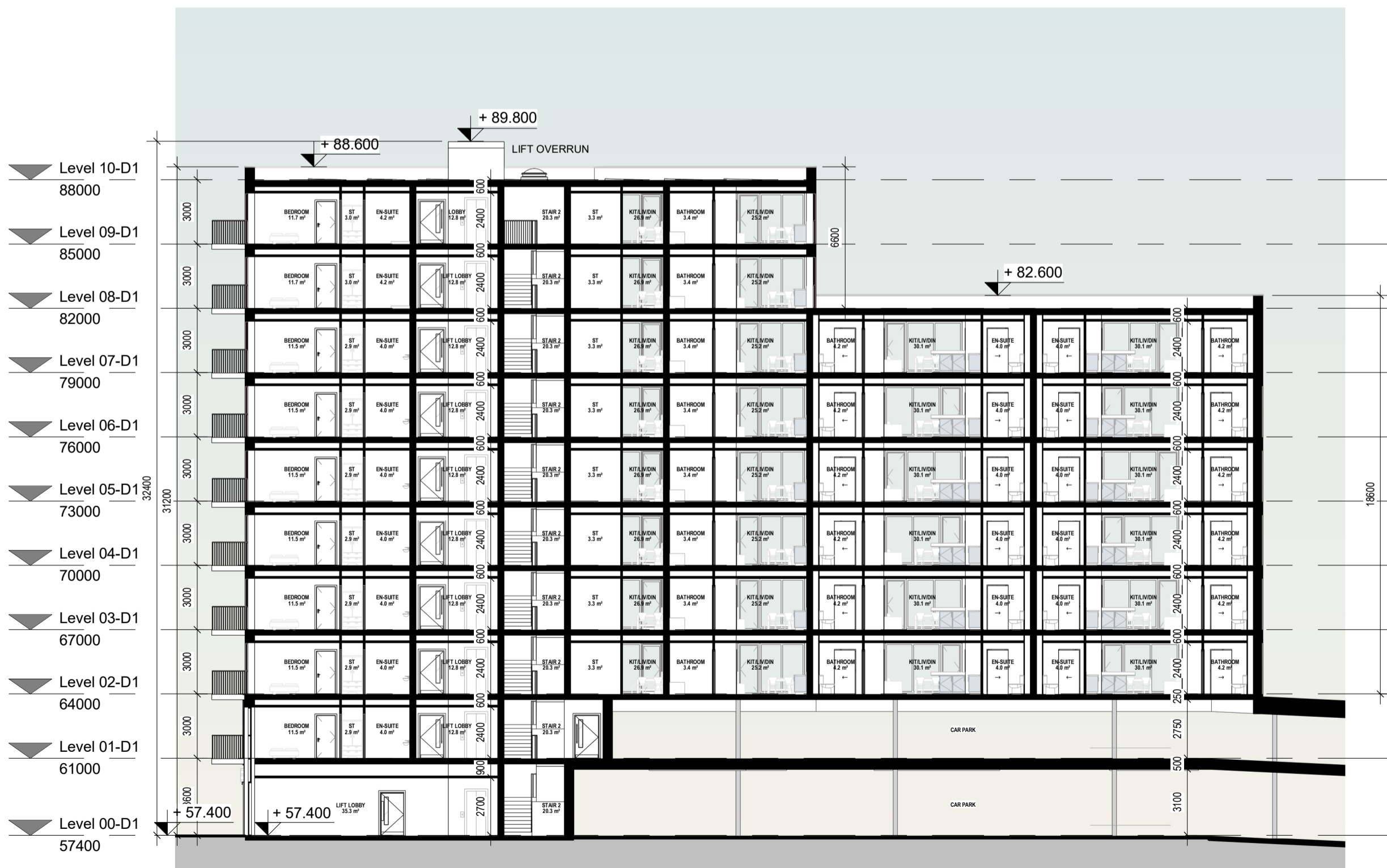
2 BLOCK D-SECTION B-B 1 : 200