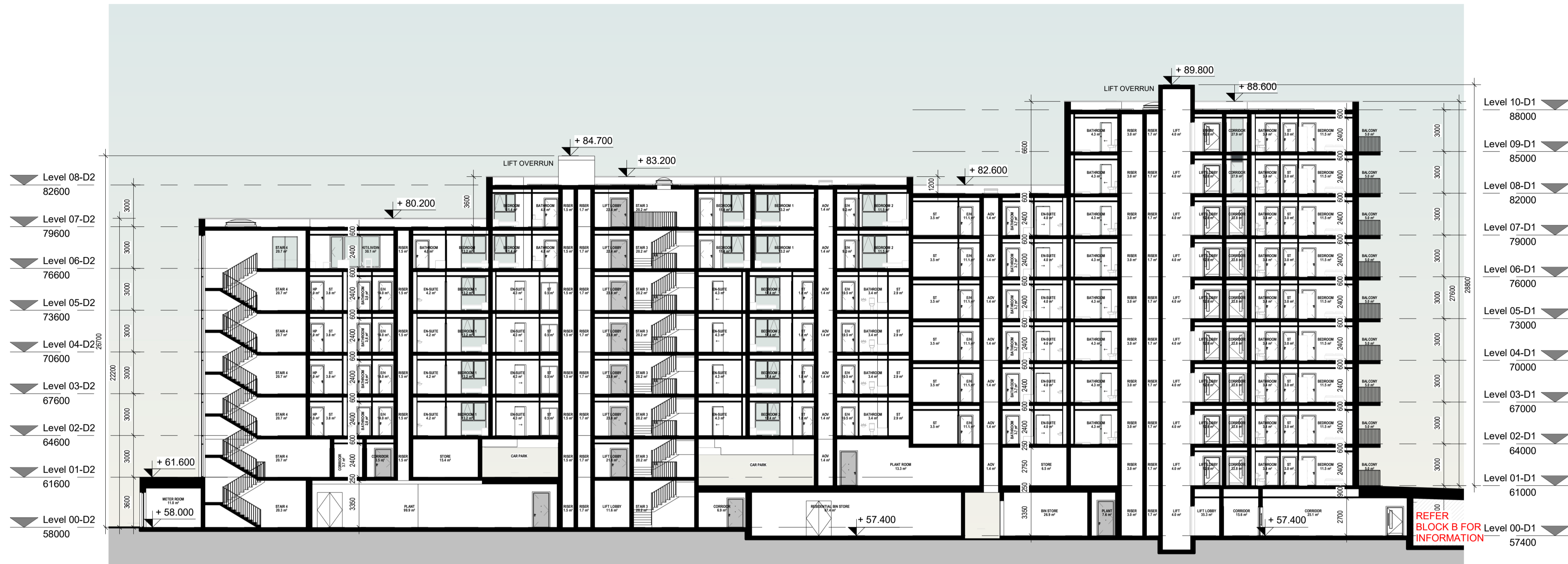
1 BLOCK D-SECTION A-A 1 : 200