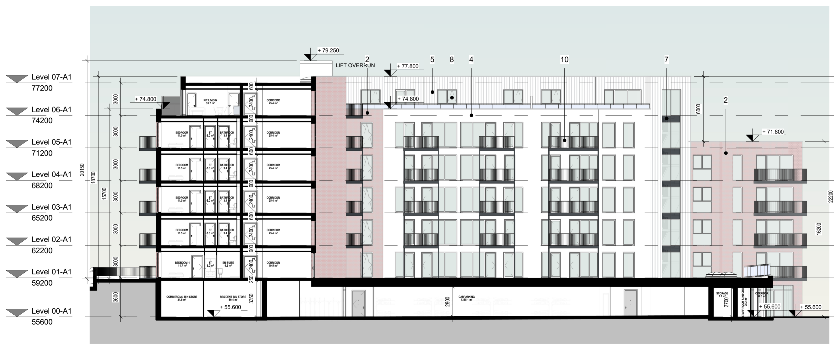
2 BLOCK A-SECTION D-D 1 : 200