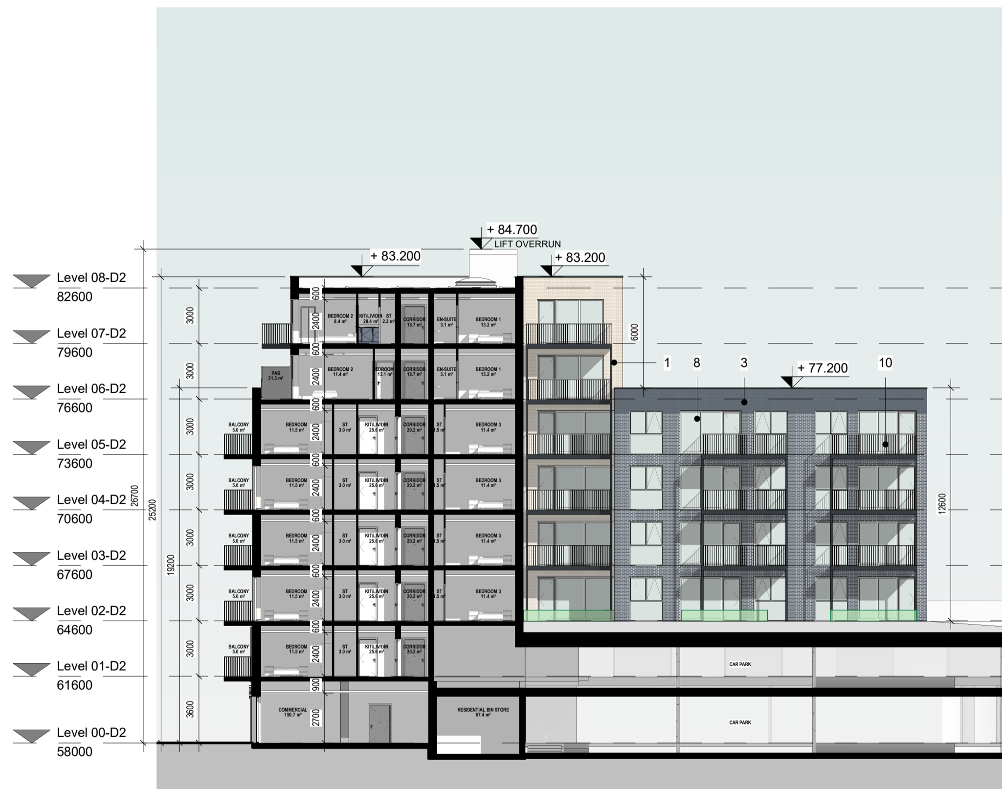
1 BLOCK D- PROPOSED COURTYARD-EAST ELEVATION 1:200

Please consider the environment before printing this sheet