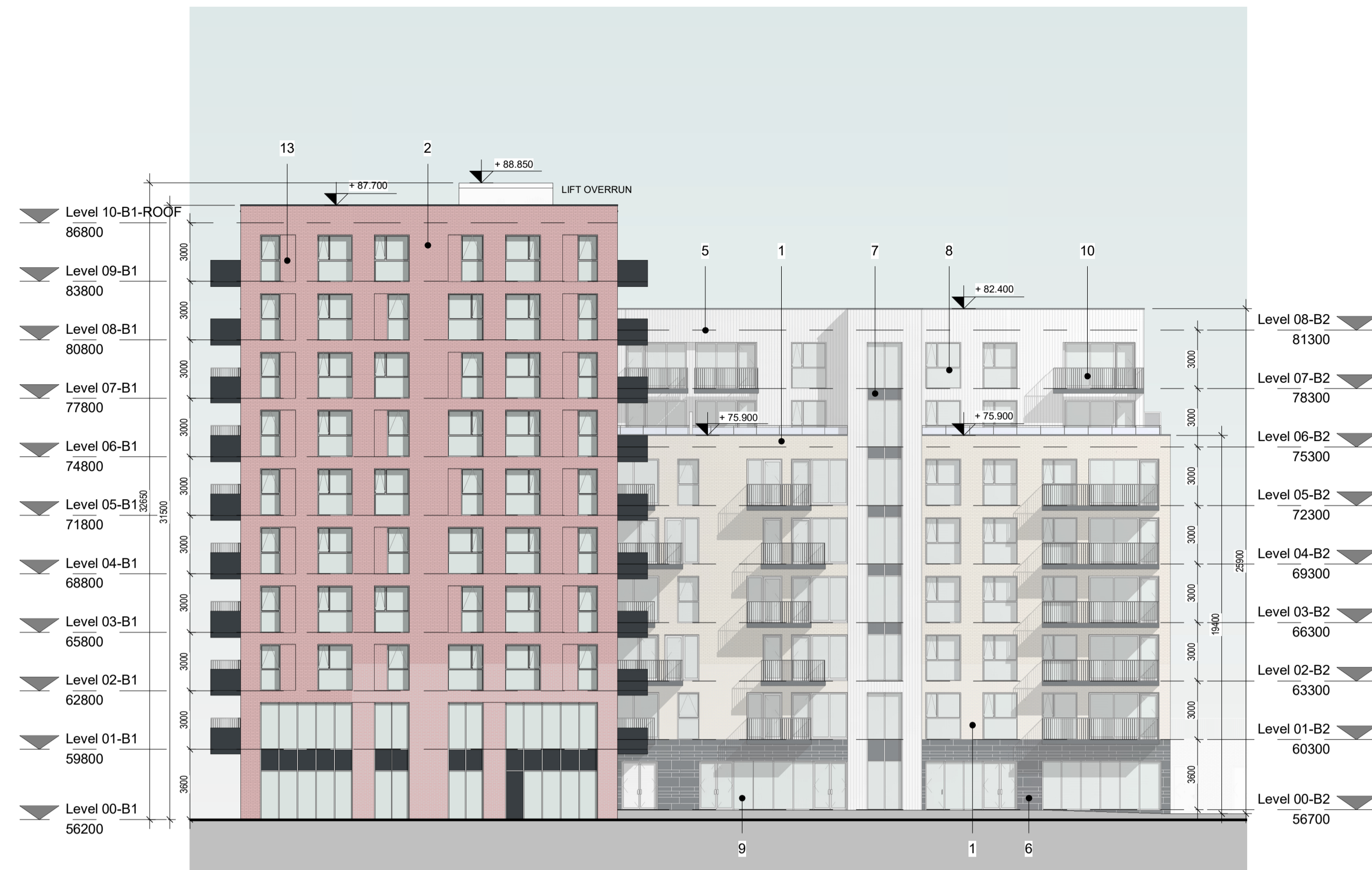
1 BLOCK B- PROPOSED EAST ELEVATION 1 : 200