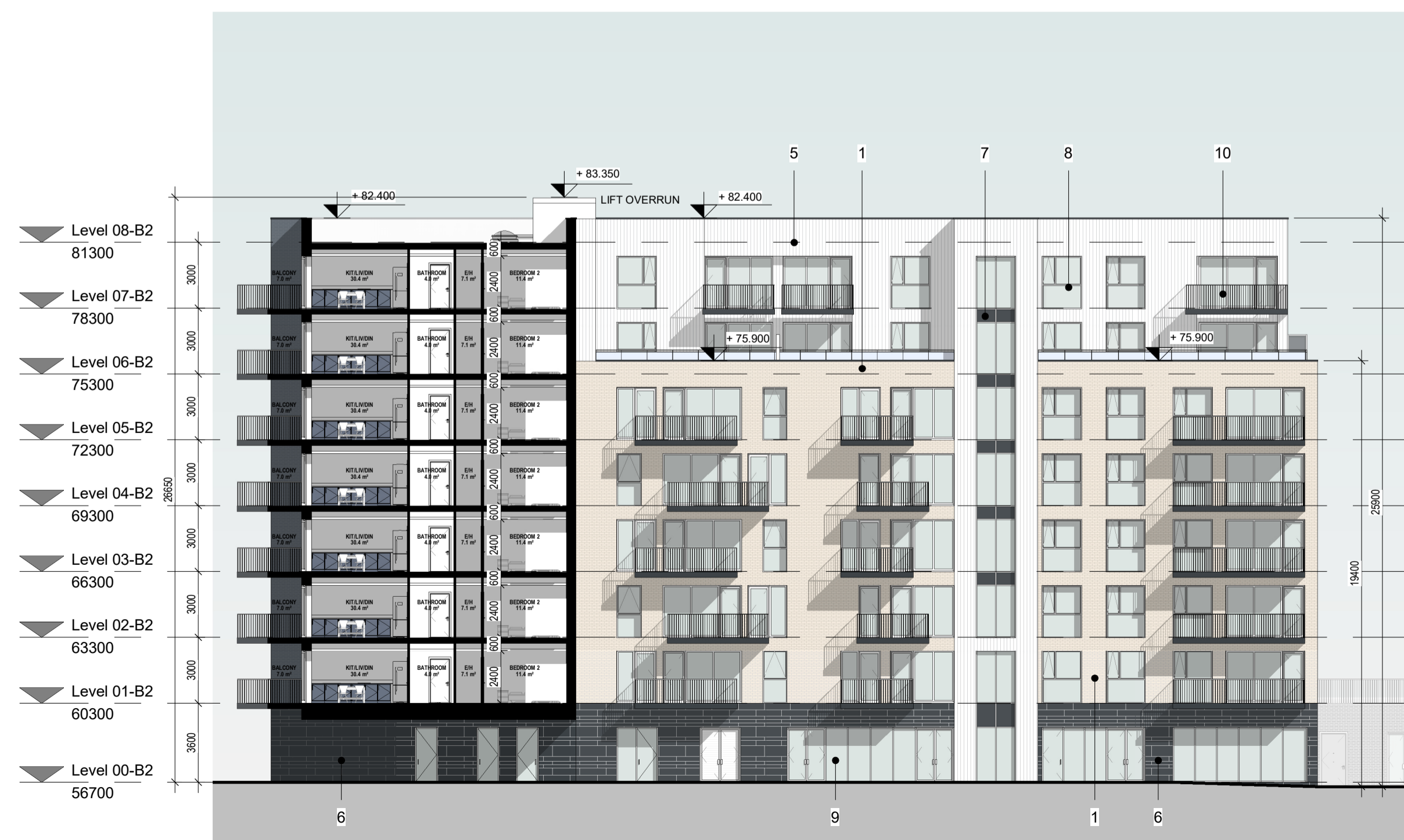
2 BLOCK B- PROPOSED COURTYARD-EAST ELEVATION 1 : 200