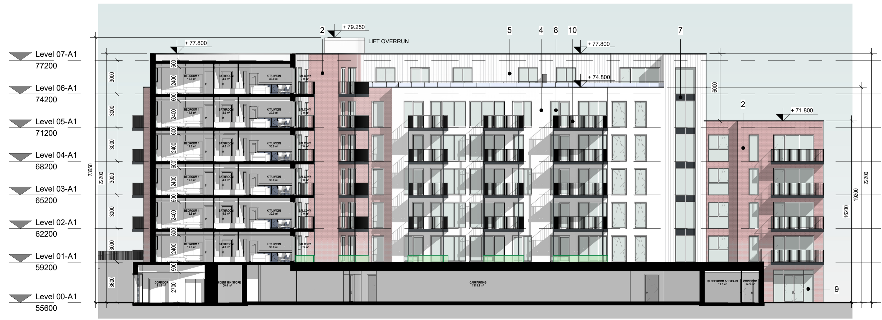
3 BLOCK A- PROPOSED COURTYARD-WEST ELEVATION 1 : 200