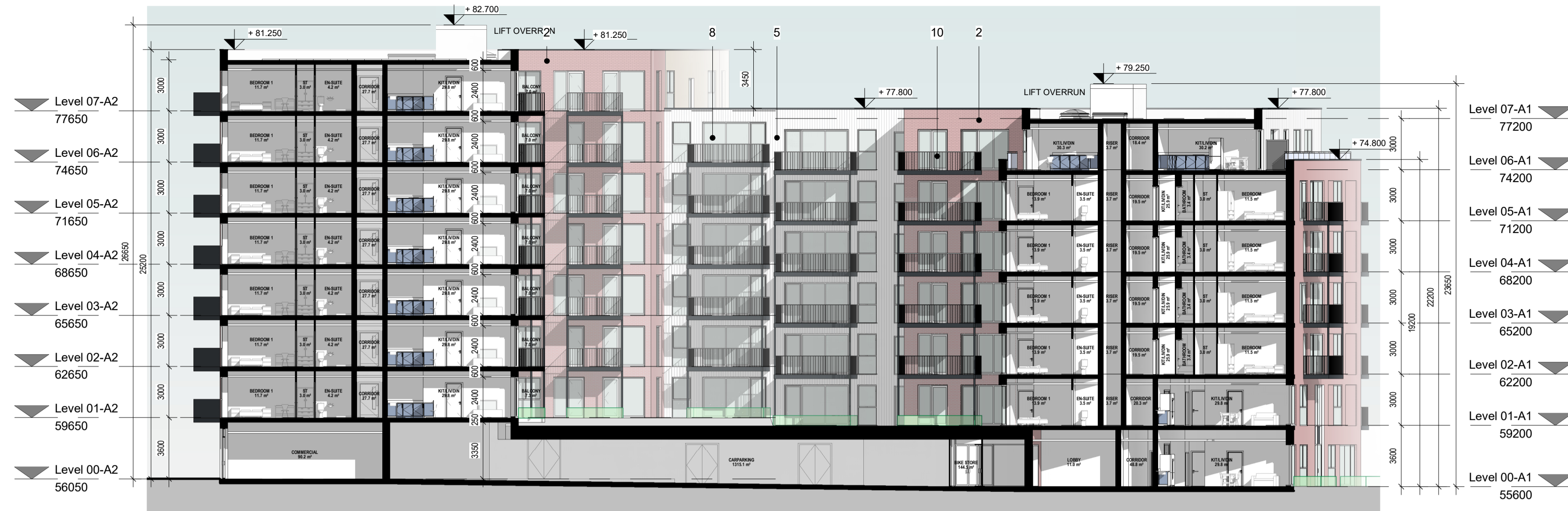
1 BLOCK A- PROPOSED COURTYARD -SOUTH ELEVATION 1 : 200