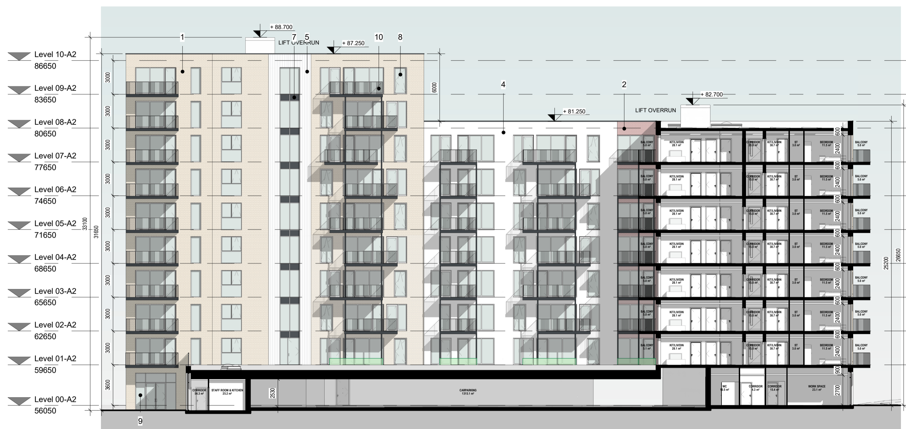
2 BLOCK A- PROPOSED COURTYARD-EAST ELEVATION 1 : 200