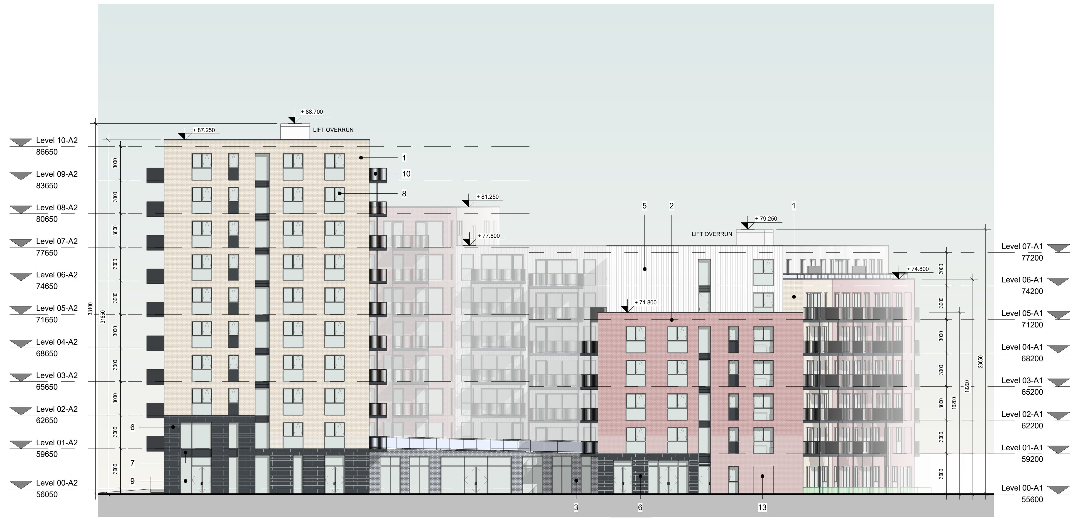
1 BLOCK A- PROPOSED SOUTH ELEVATION 1 : 200