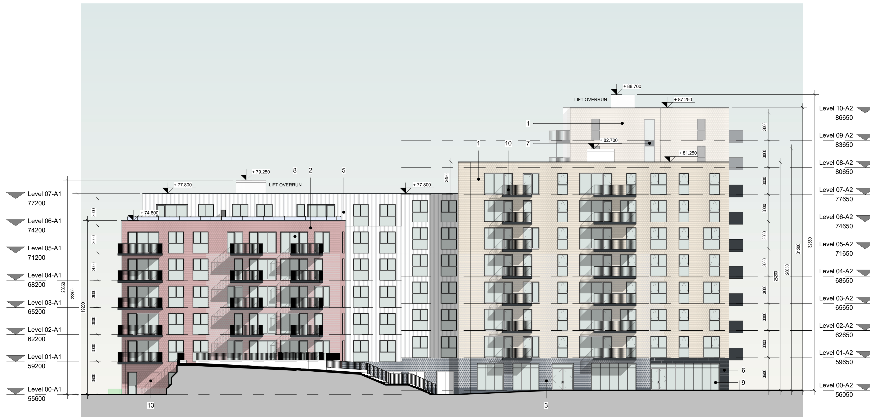
2 BLOCK A- PROPOSED NORTH ELEVATION 1 : 200