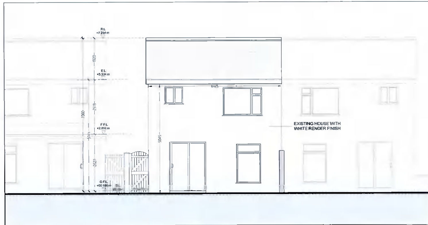
3 - REAR ELEVATION (SOUTH)