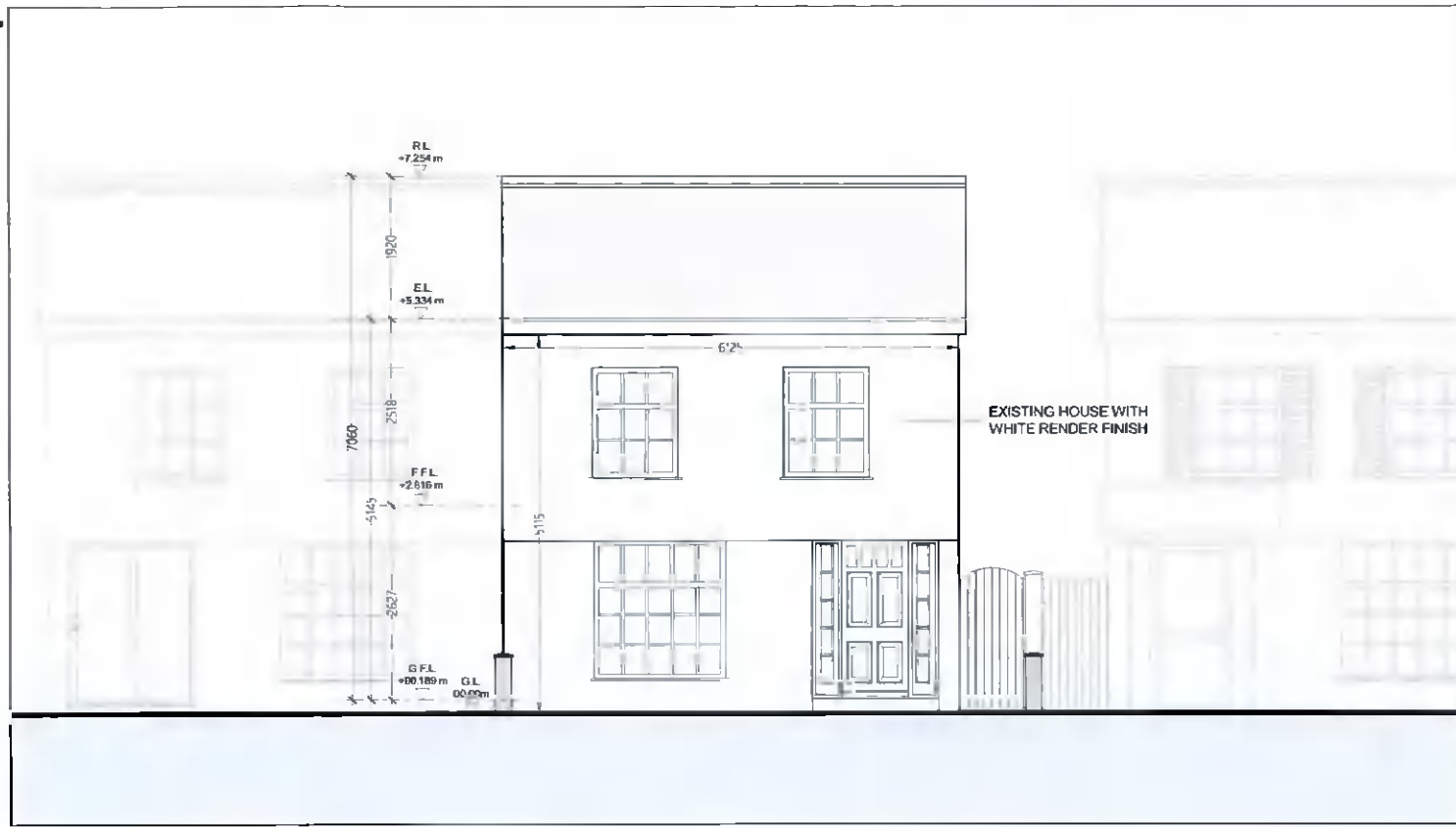
1 - FRONT ELEVATION (NORTH)