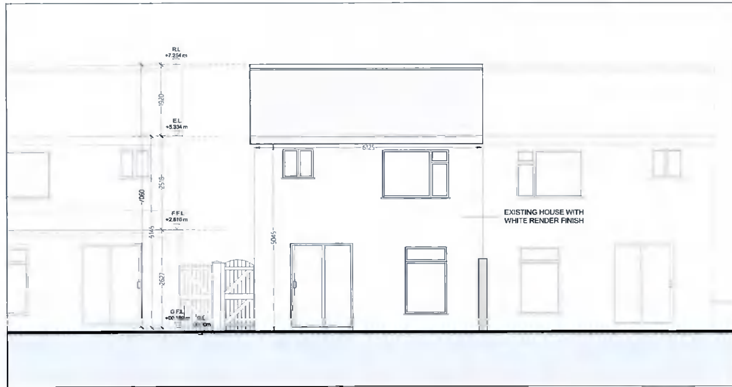
3 - REAR ELEVATION (SOUTH)