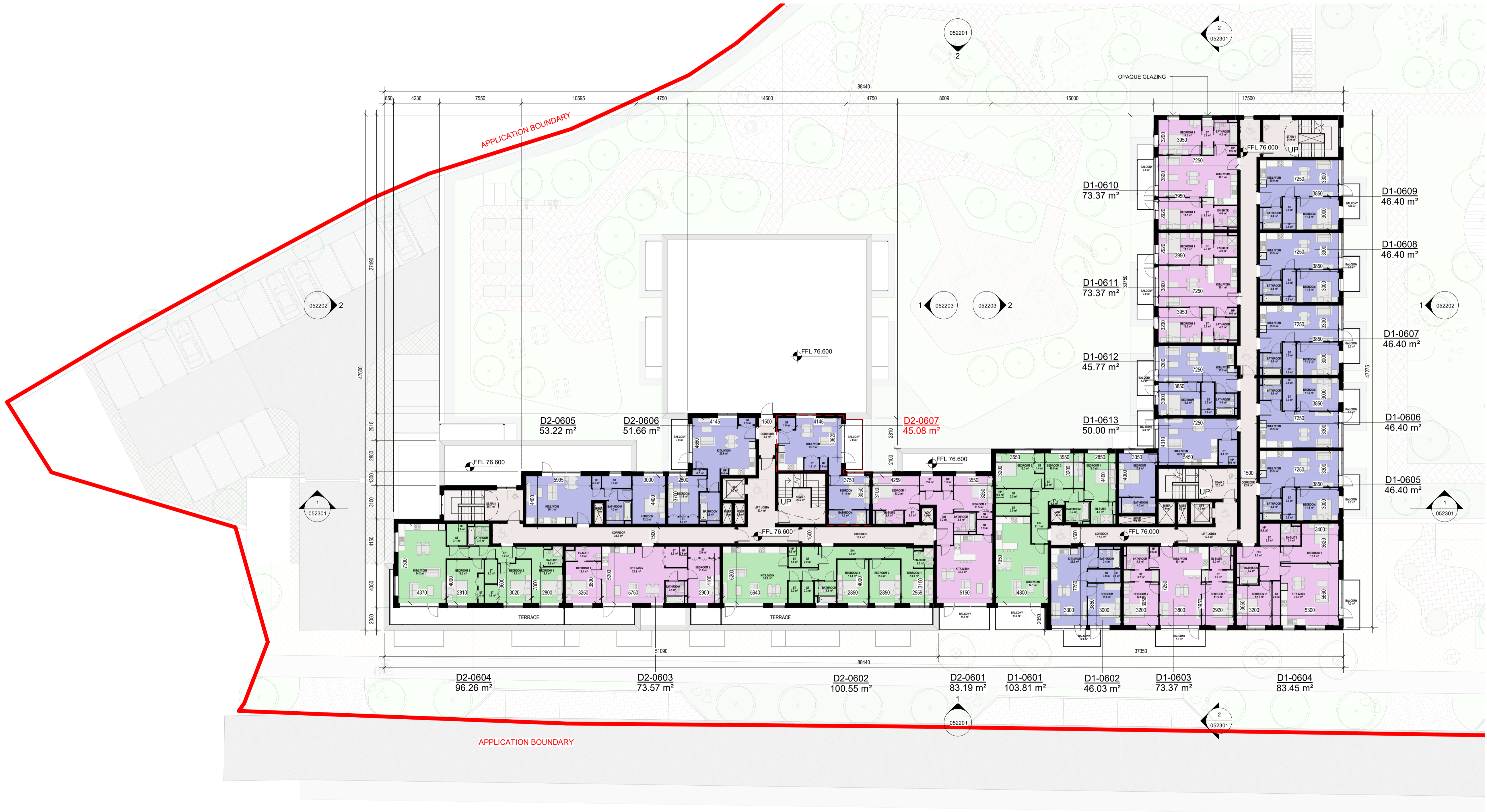
1 BLOCK D -L06-SIXTH FLOOR PLAN_Part V 1:200

Please consider the environment before printing this sheet