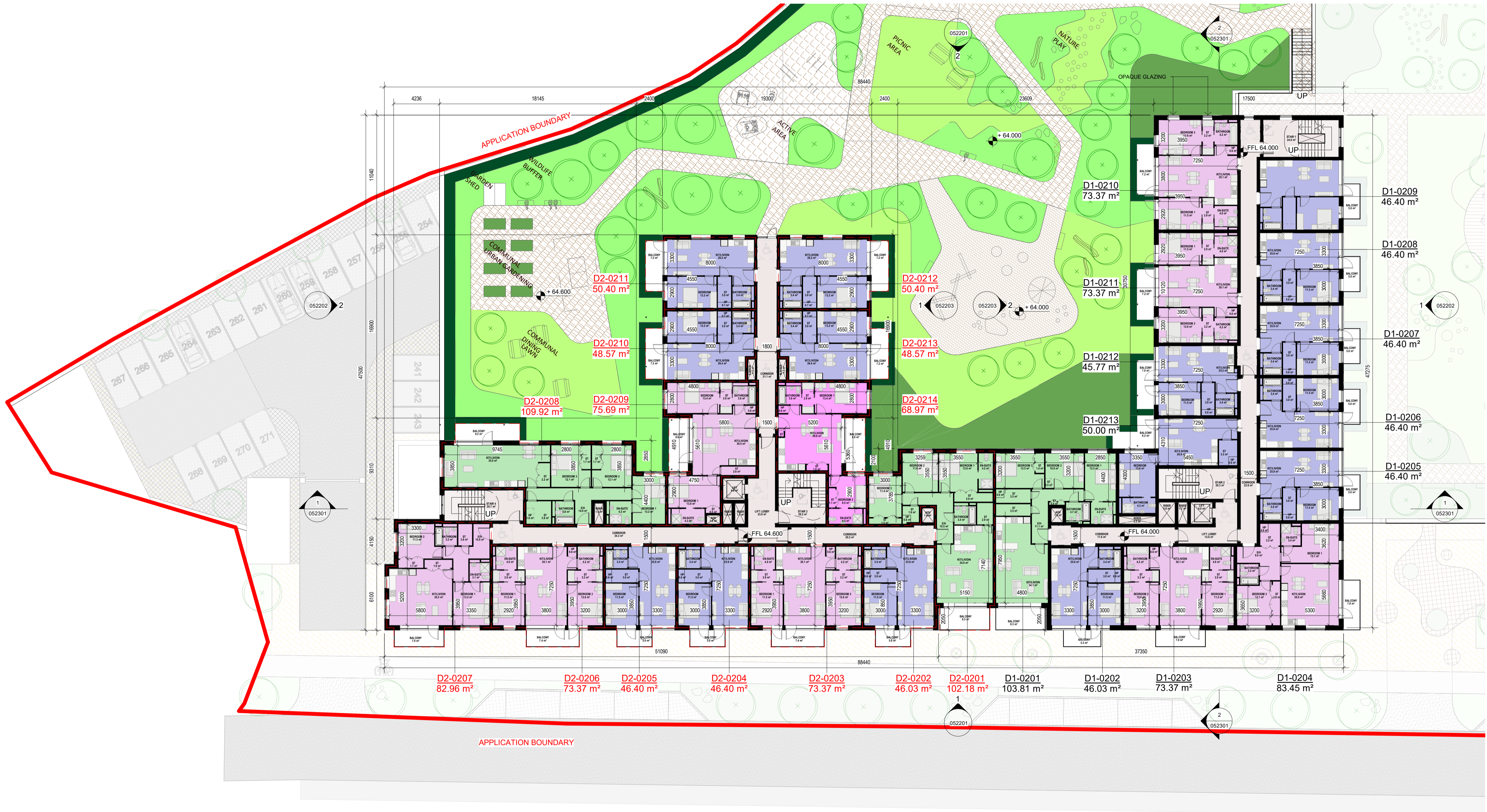
1 BLOCK D -L02-SECOND FLOOR PLAN_Part V 1:200

Please consider the environment before printing this sheet