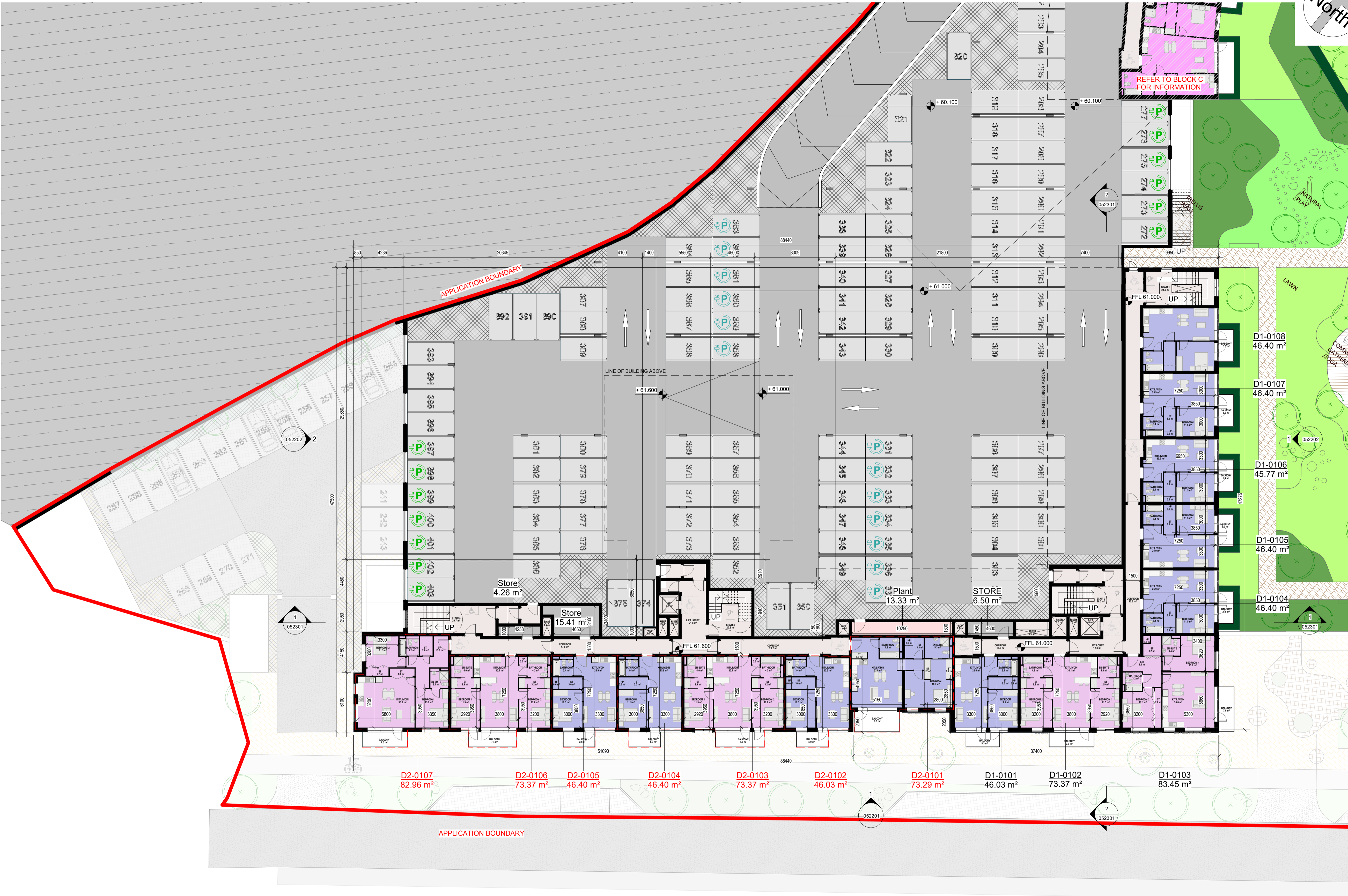
1 BLOCK D -L01-FIRST FLOOR PLAN_Part V 1:200

Please consider the environment before printing this sheet