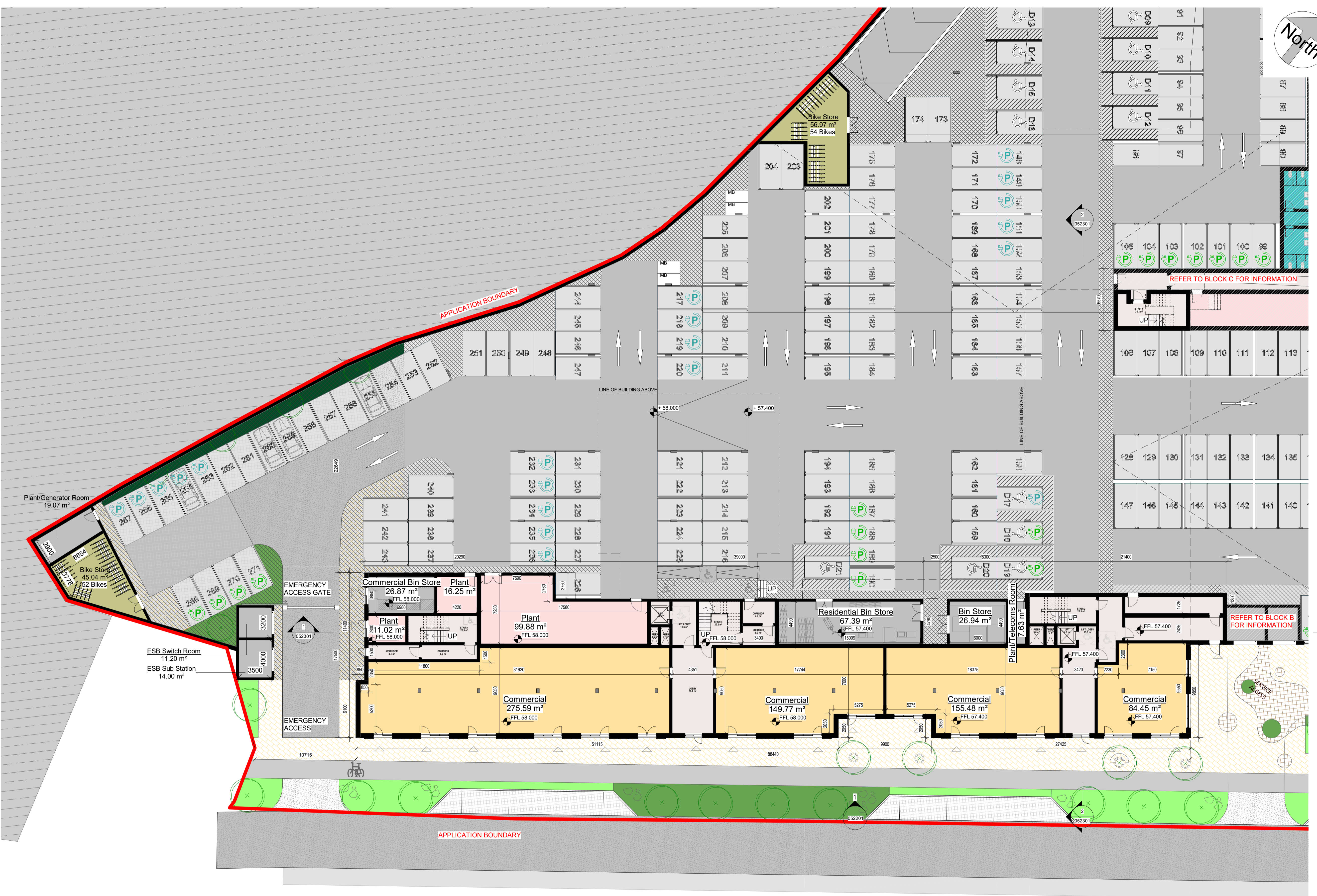
1 BLOCK D-L00-GROUND FLOOR PLAN 1 : 200

Please consider the environment before printing this sheet