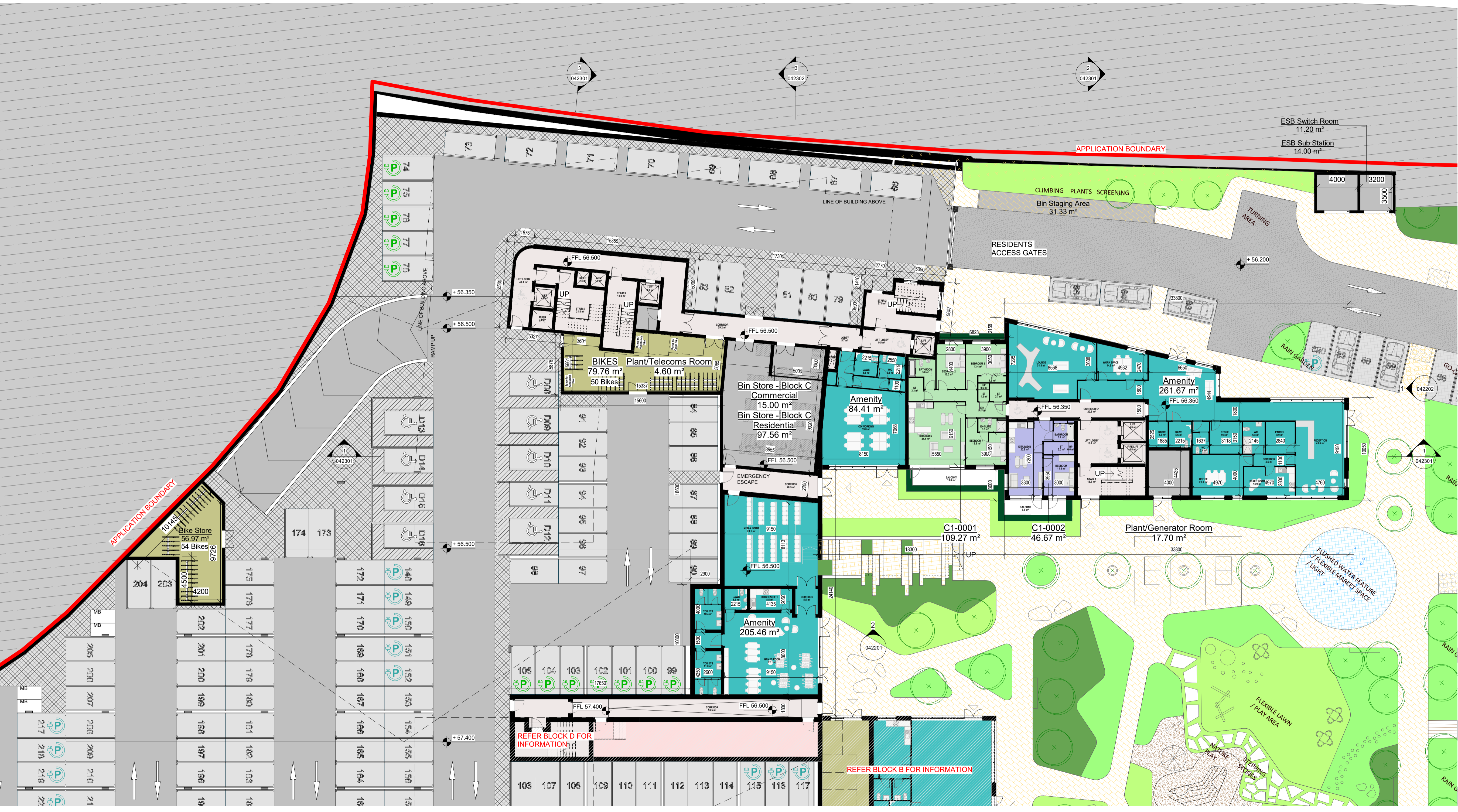
1 BLOCK C - L00-GROUND FLOOR PLAN 1:200

Please consider the environment before printing this sheet