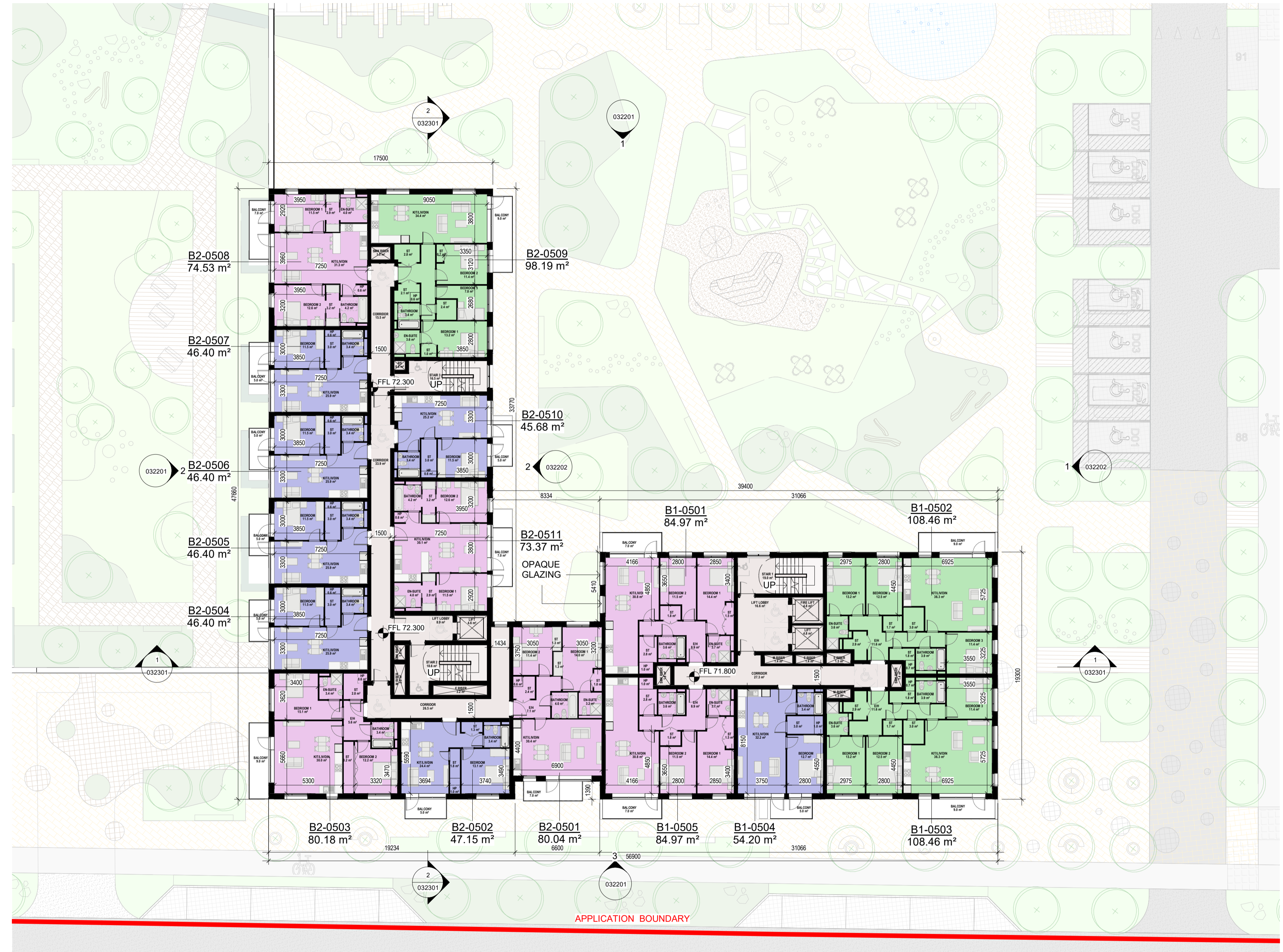
1 BLOCK B -L05-FIFTH FLOOR PLAN 1:200

Please consider the environment before printing this sheet