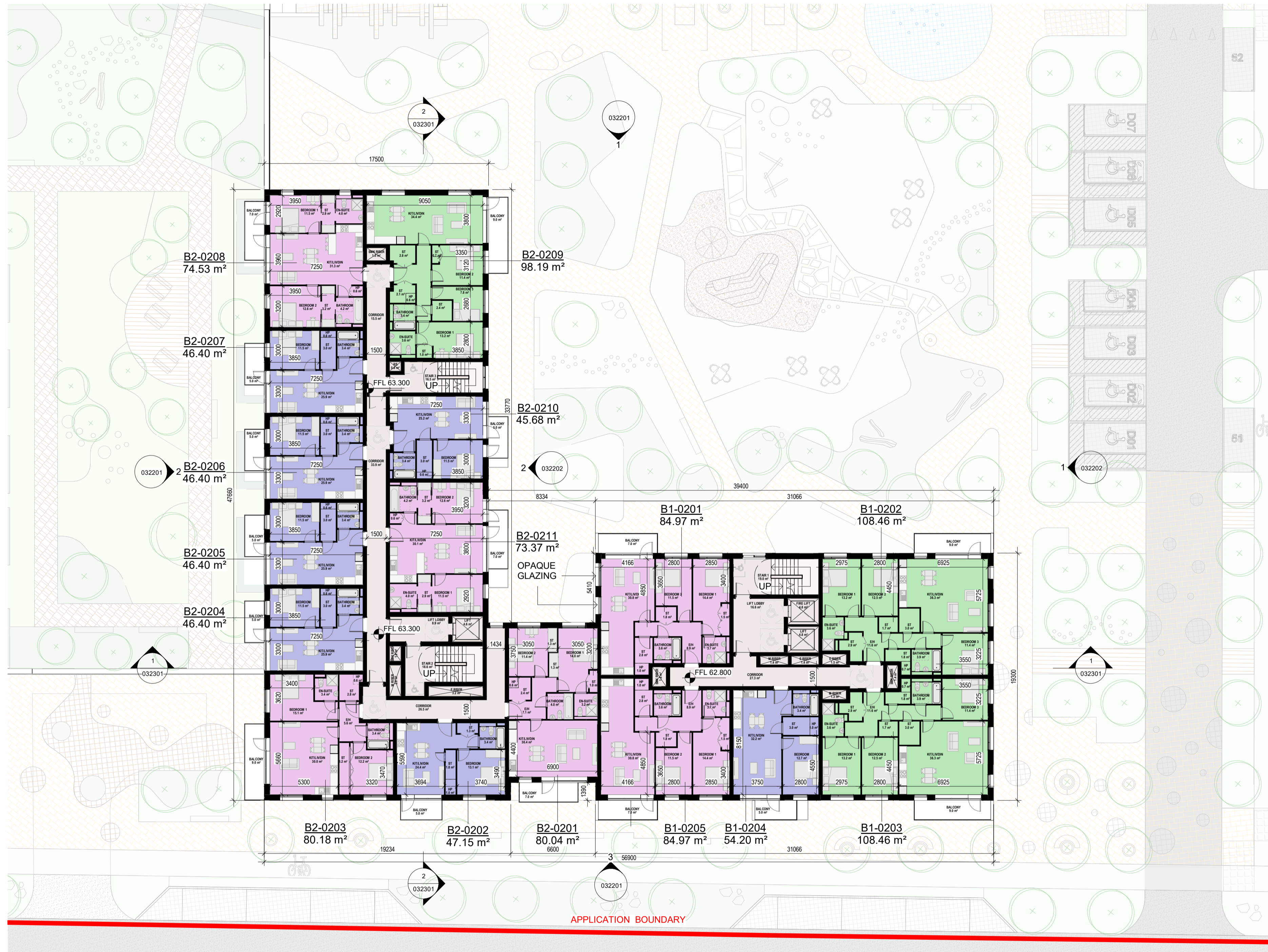
1 BLOCK B -L02-SECOND FLOOR PLAN 1 : 200

Please consider the environment before printing this sheet