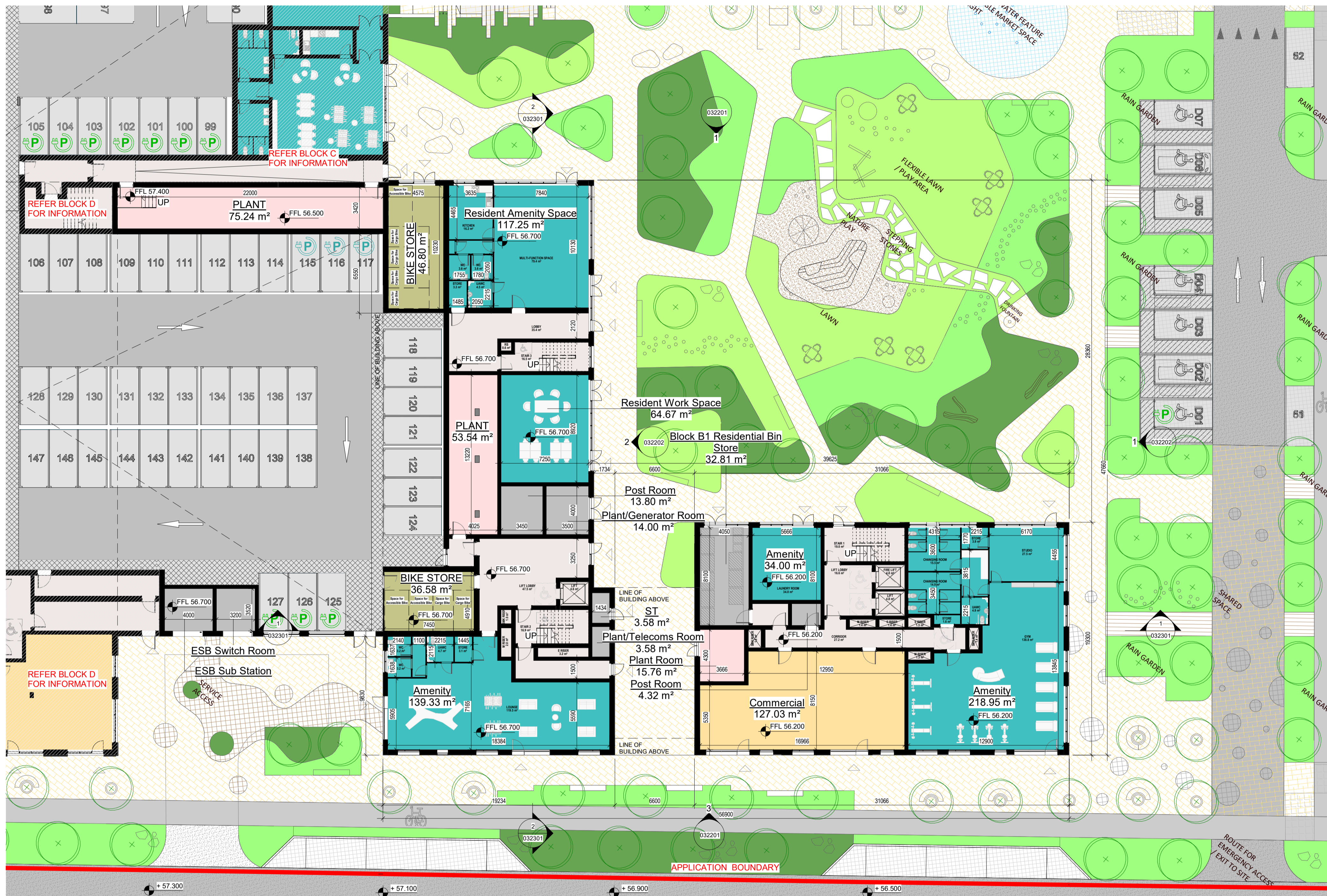
1 BLOCK B -L00-GROUND FLOOR PLAN 1:200

Please consider the environment before printing this sheet