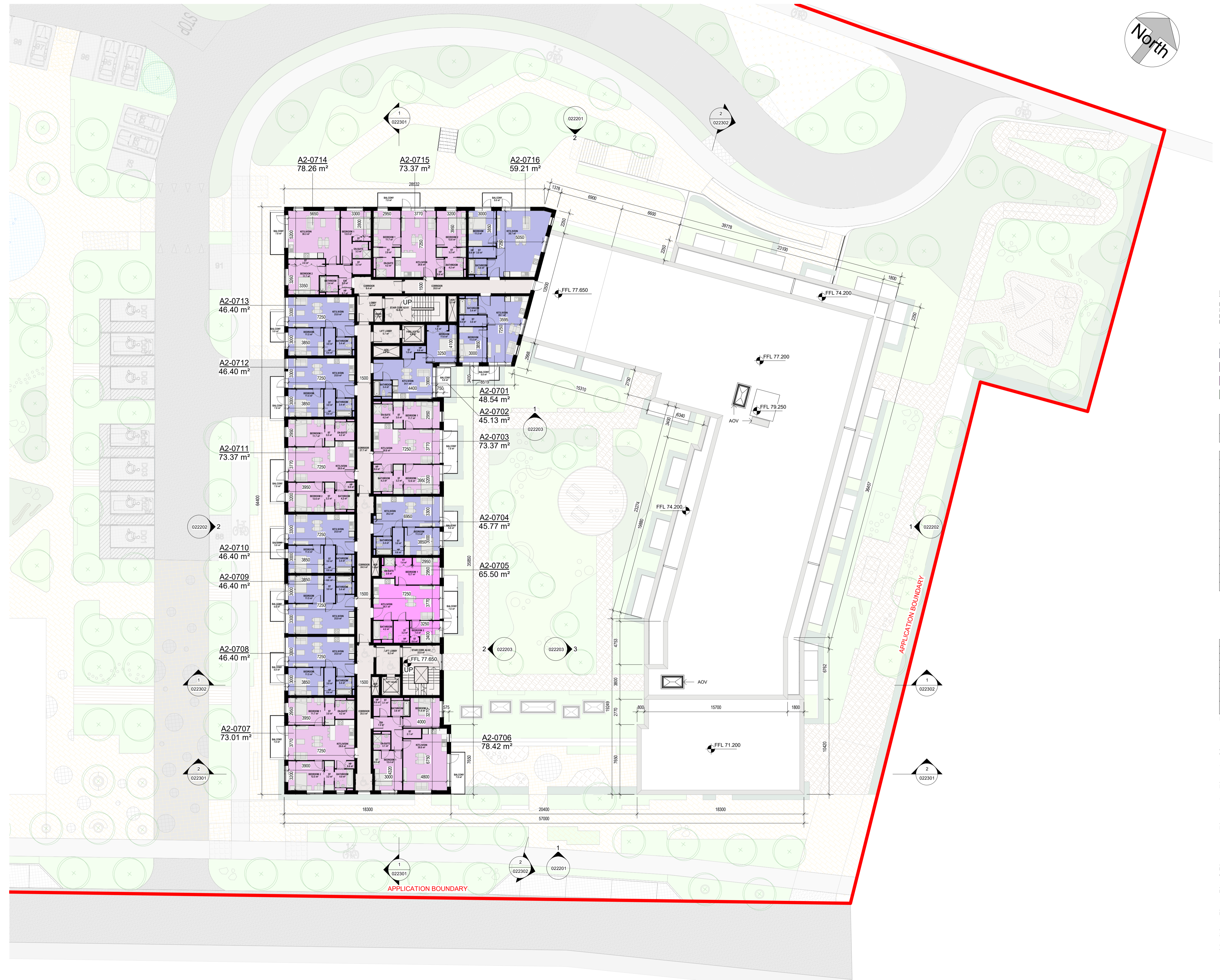
1 BLOCK A -L07-SEVENTH FLOOR PLAN 1 : 200

Please consider the environment before printing this sheet