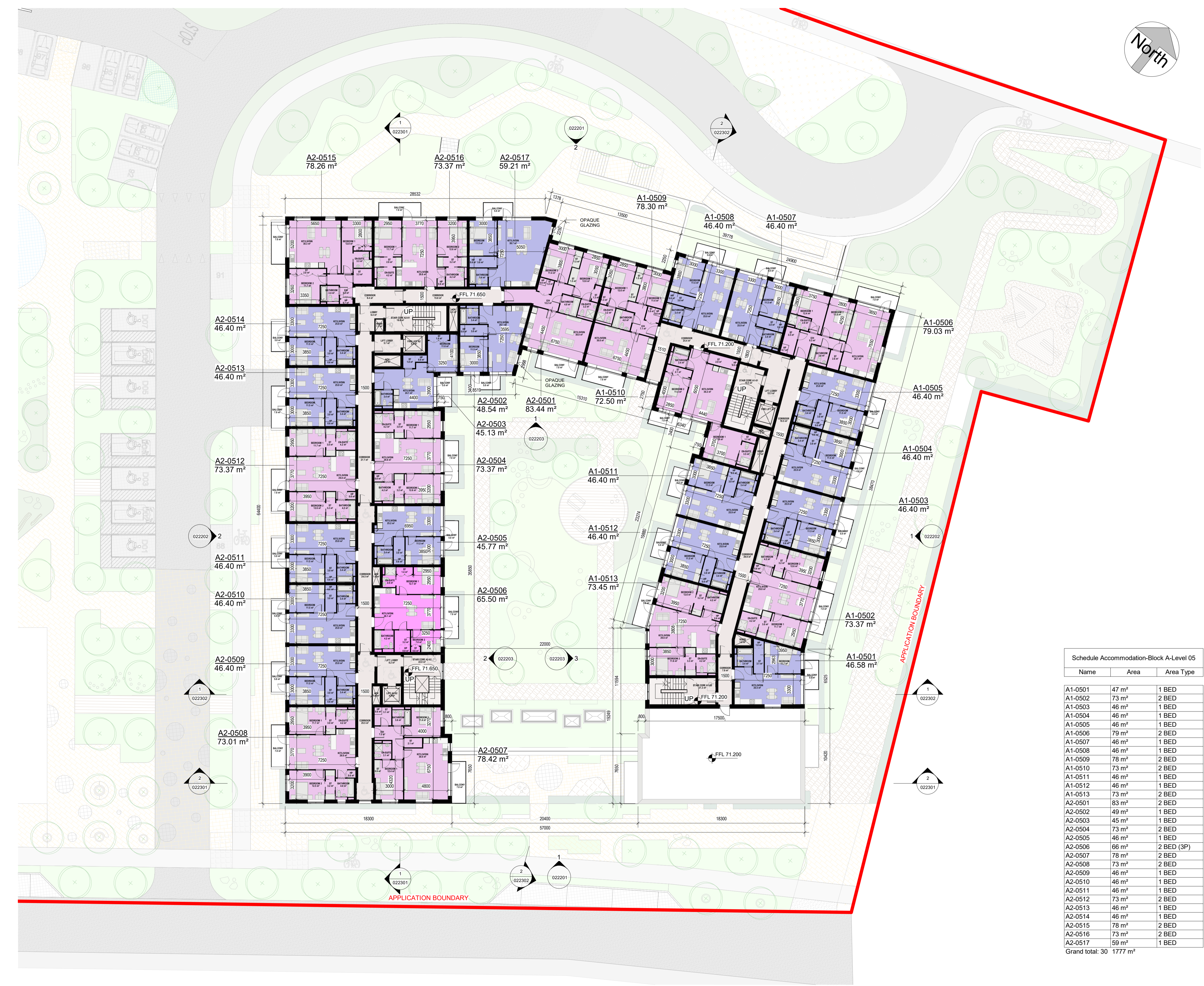
Schedule Accommodation-Block A-Level 05

Please consider the environment before printing this sheet