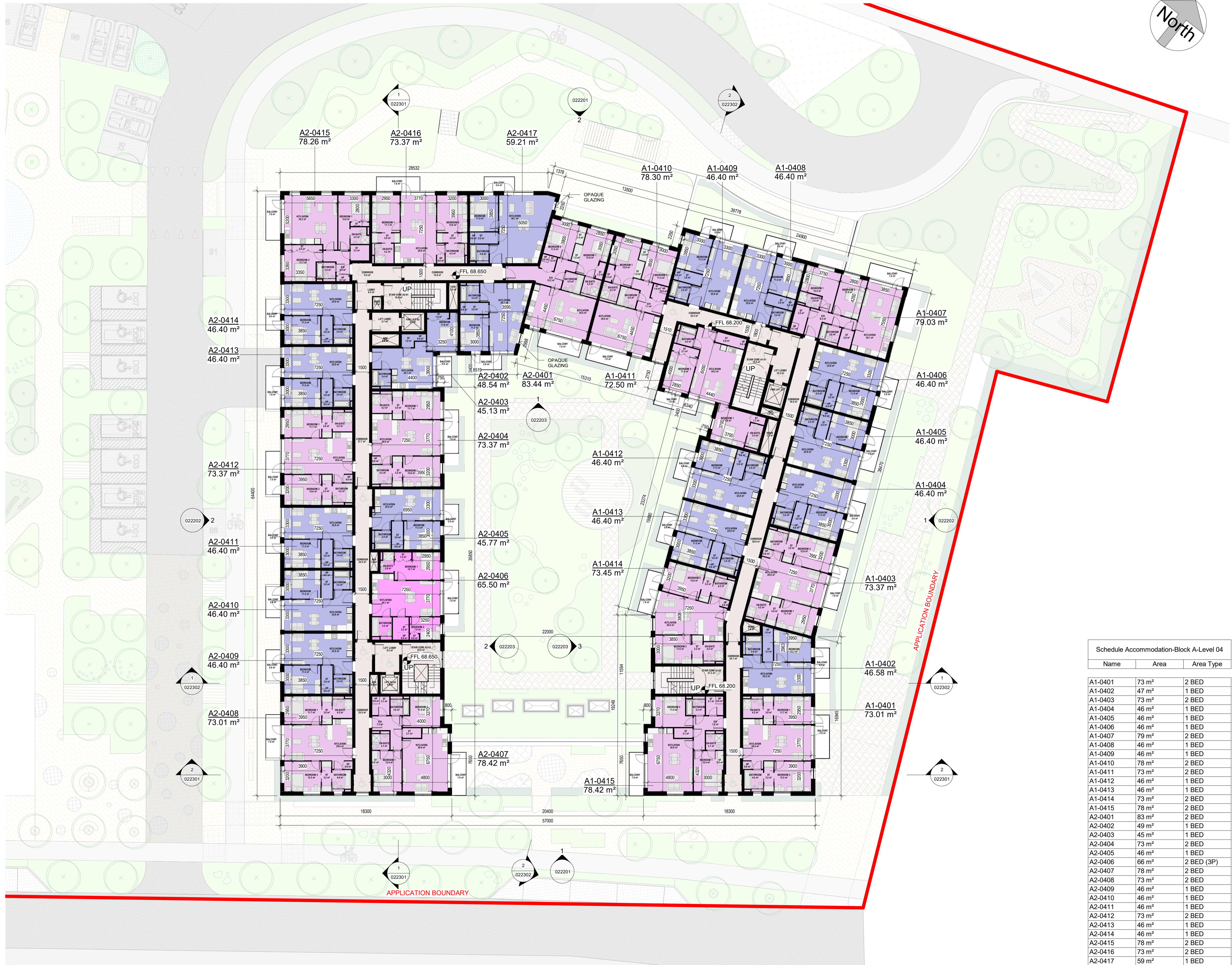
Schedule Accommodation-Block A-Level 04