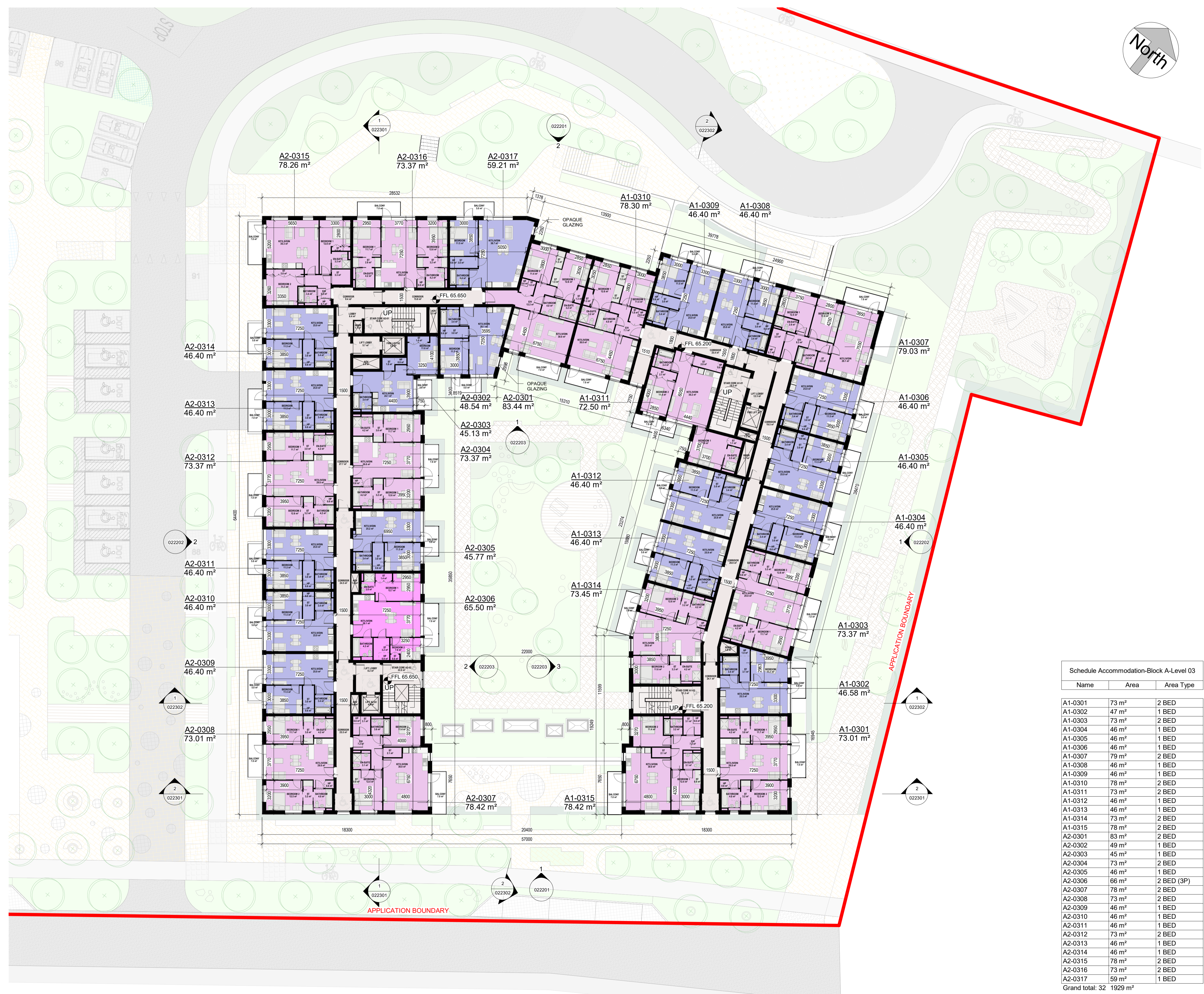
Schedule Accommodation-Block A-Level 03