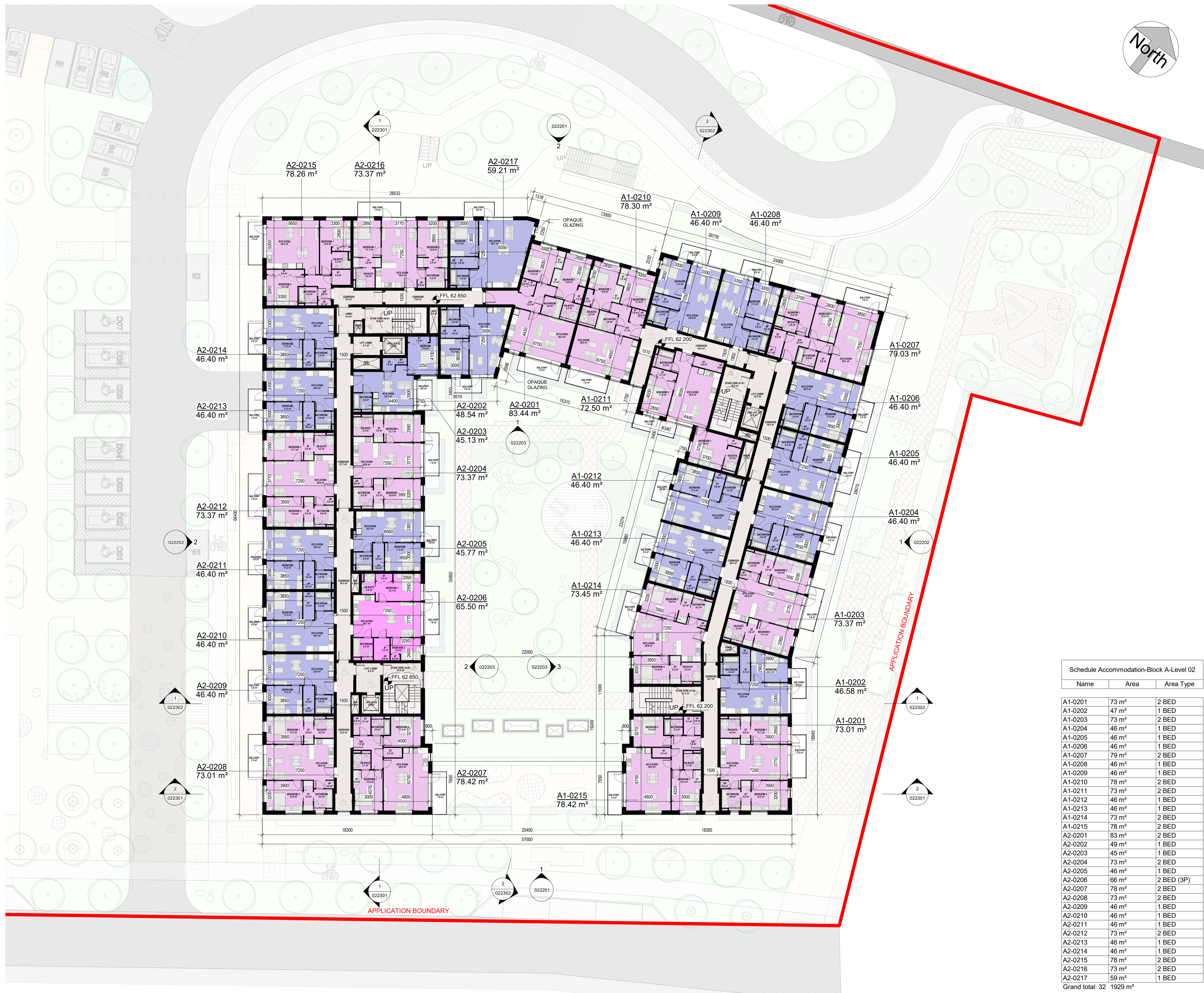
Schedule Accommodation-Block A-Level 02