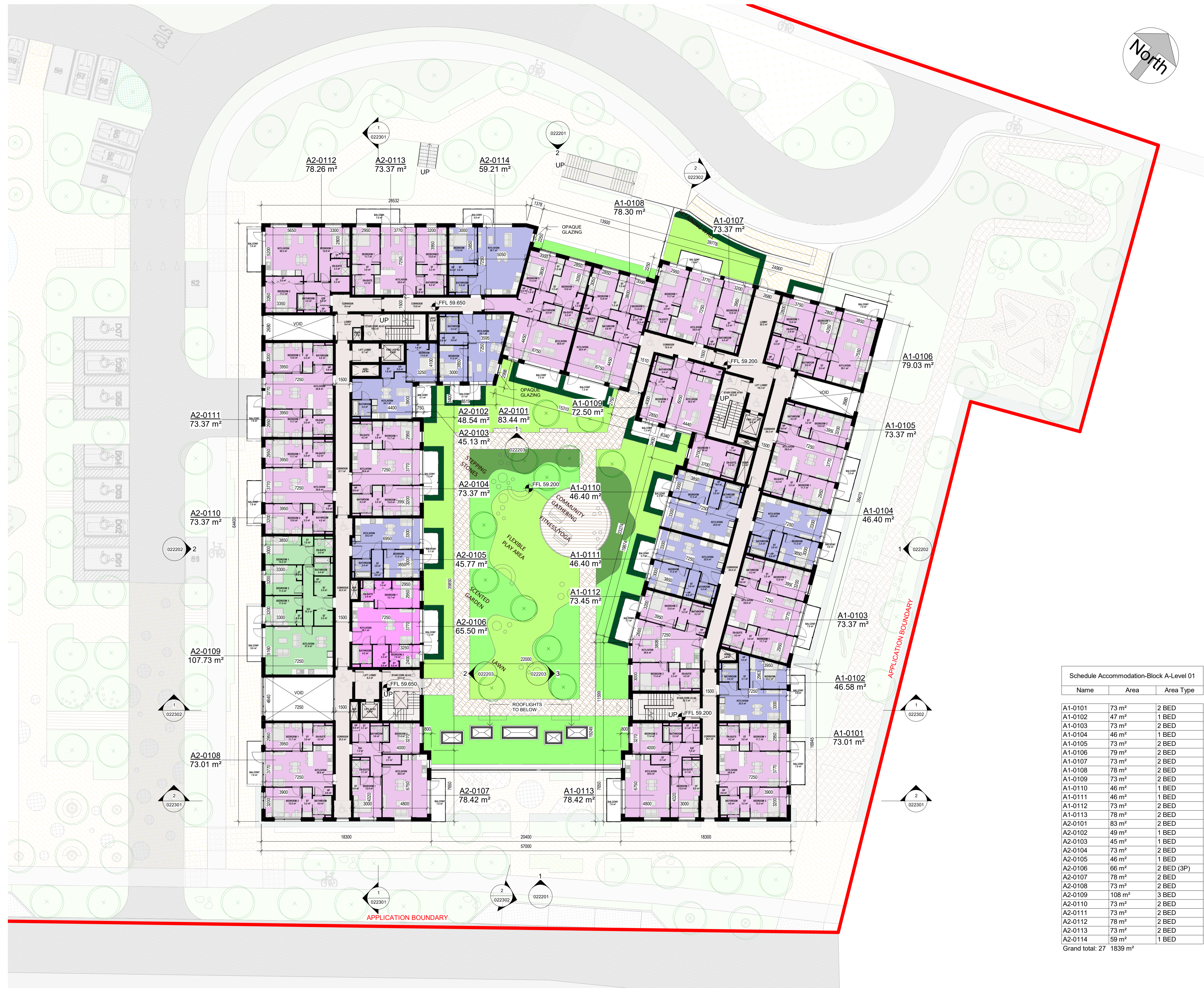
Schedule Accommodation-Block A-Level 01

AREA TYPES 1 BED 2 BED (4P) 2 BED (3P) 3 BED