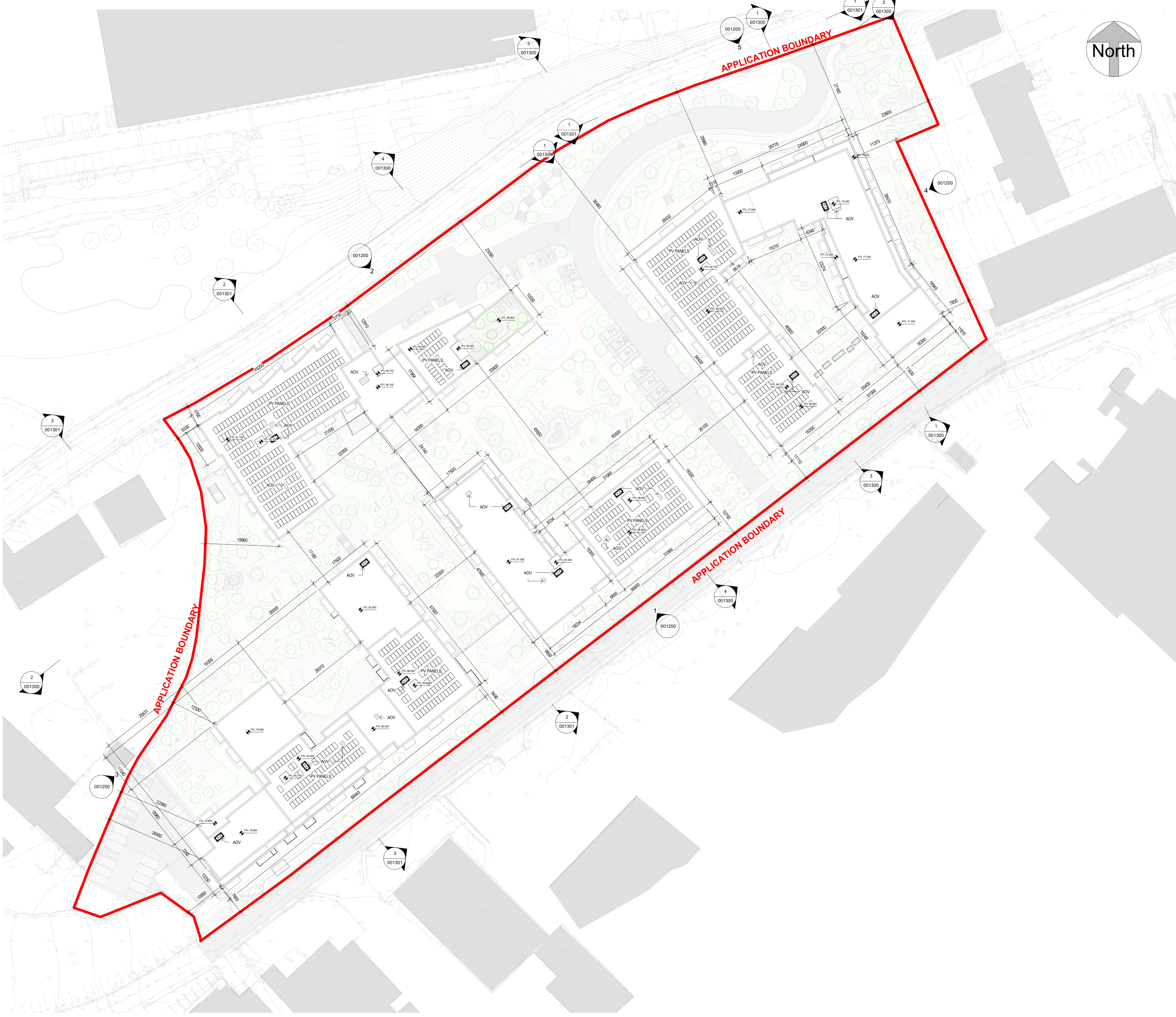
1 SITE GA PLAN - ROOF LEVEL 1:500

Please consider the environment before printing this sheet