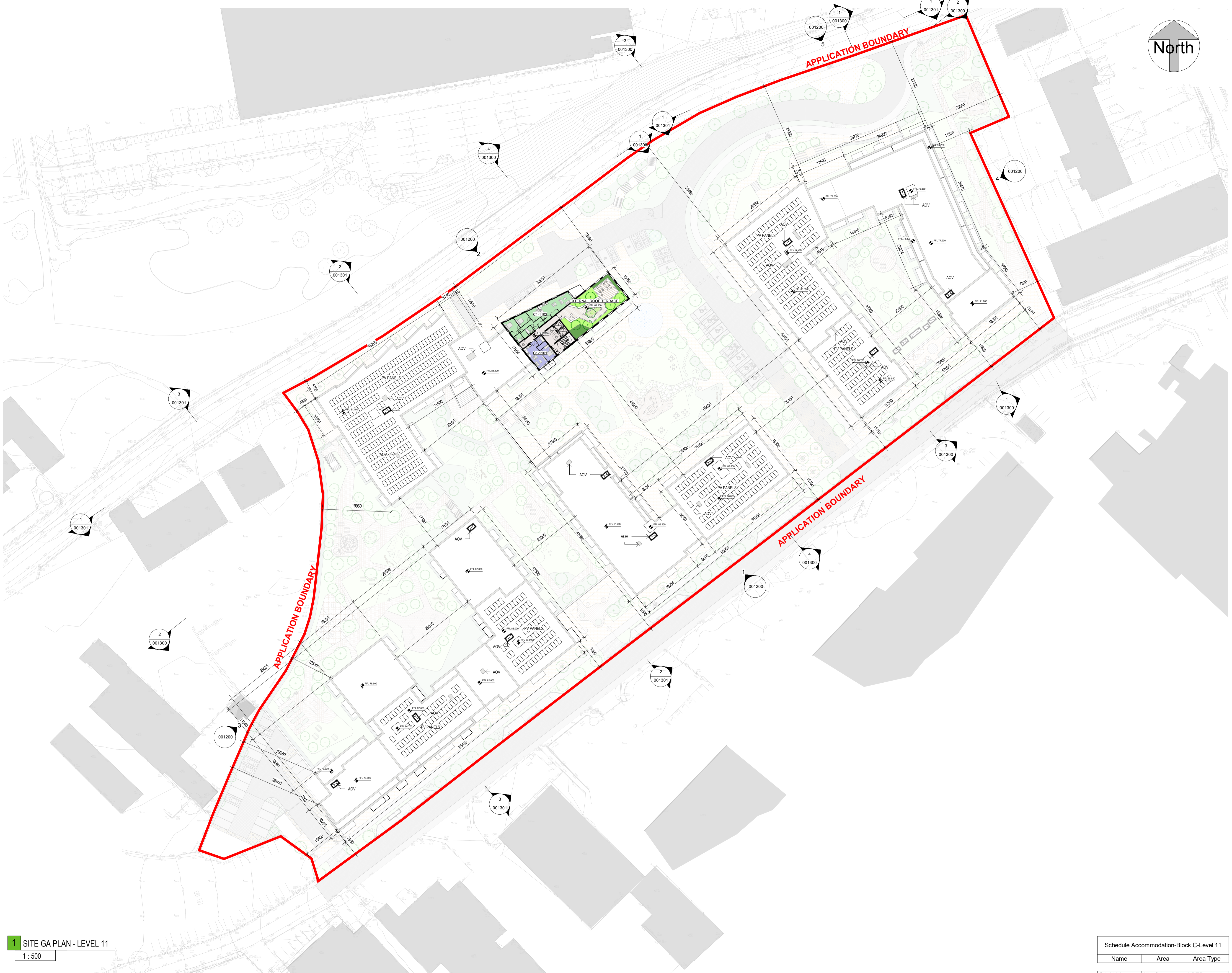
1 SITE GA PLAN - LEVEL 11 1:500

Please consider the environment before printing this sheet