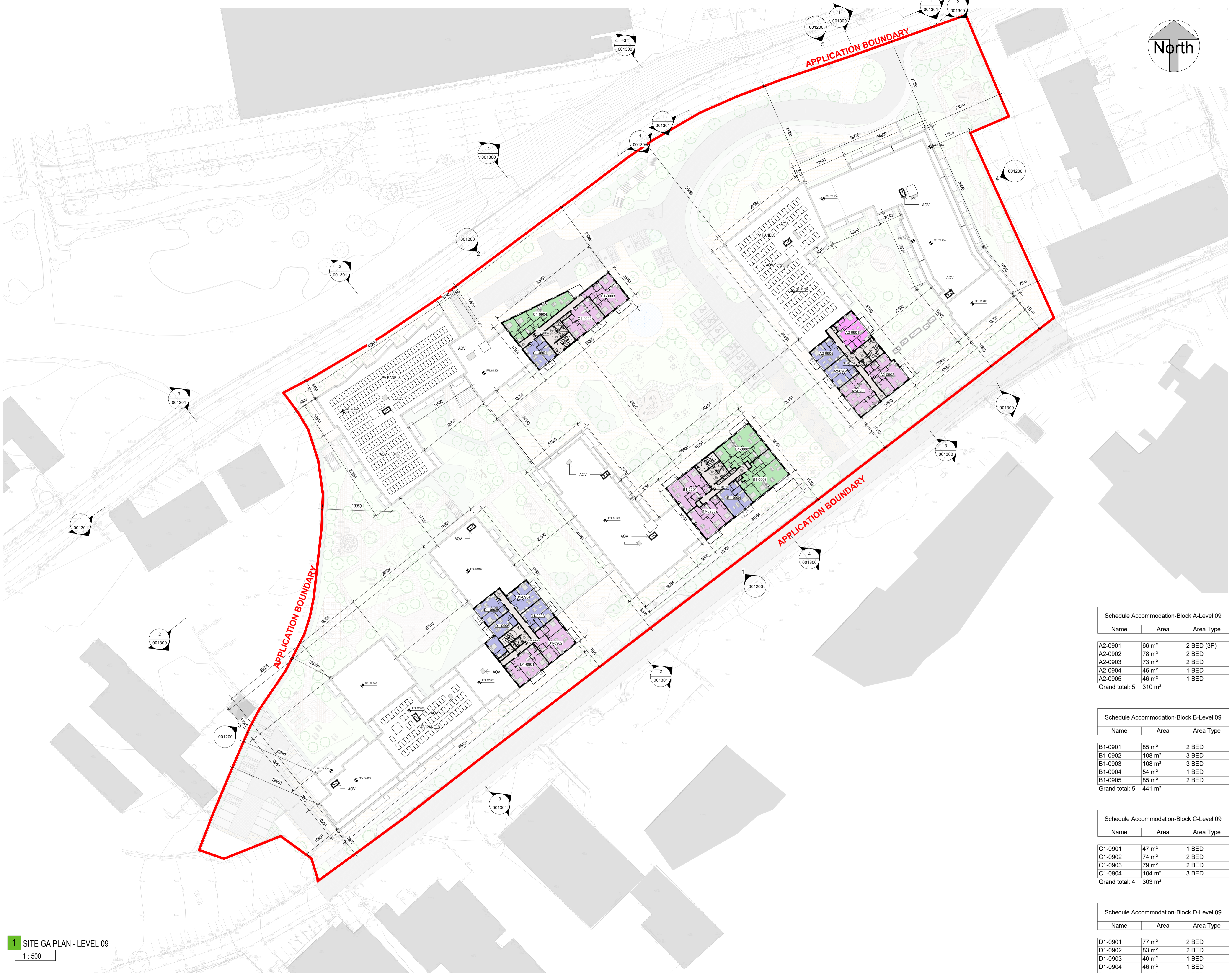
1 SITE GA PLAN - LEVEL 09 1:500

Please consider the environment before printing this sheet