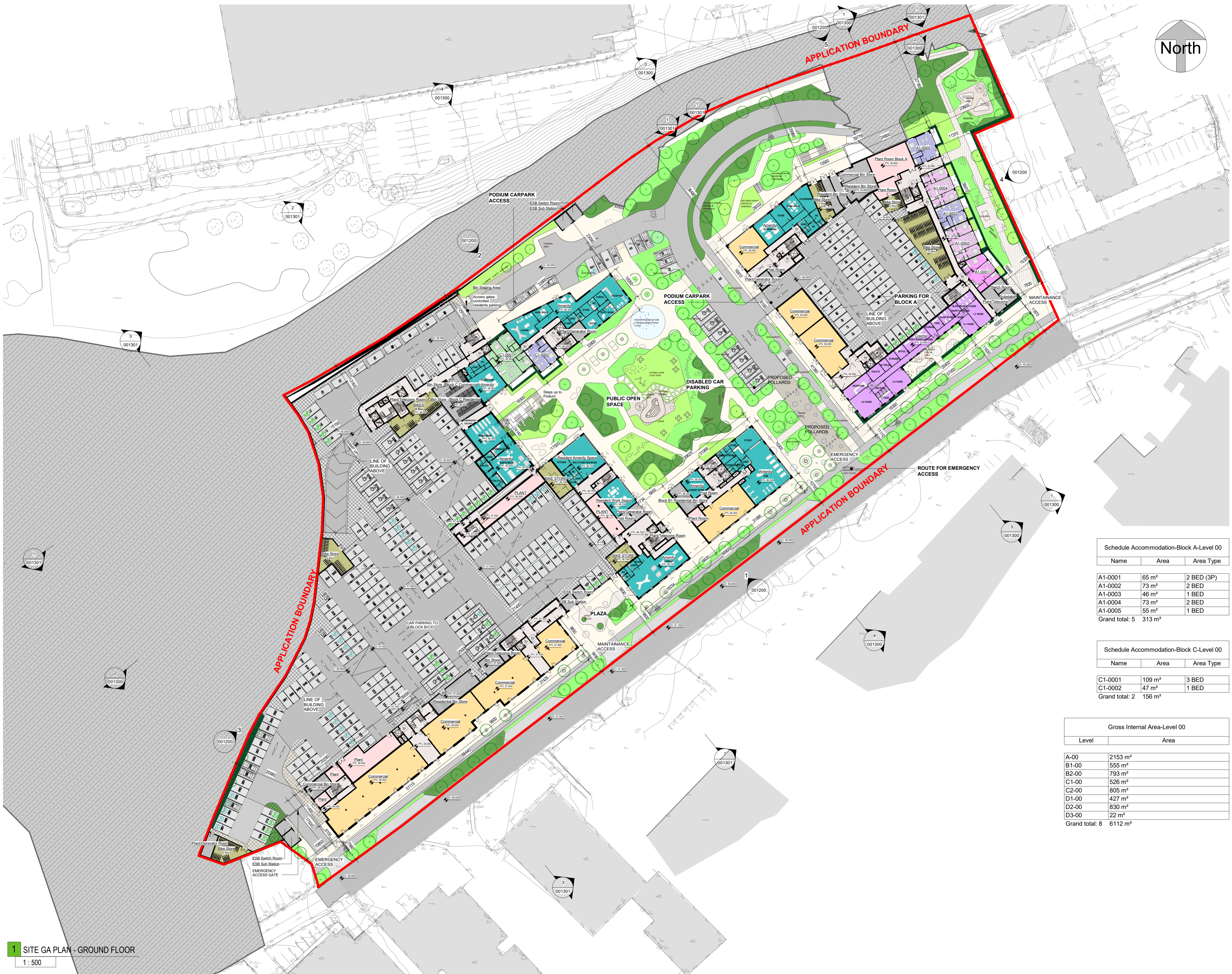
1 SITE GA PLAN - GROUND FLOOR 1 : 500

Please consider the environment before printing this sheet