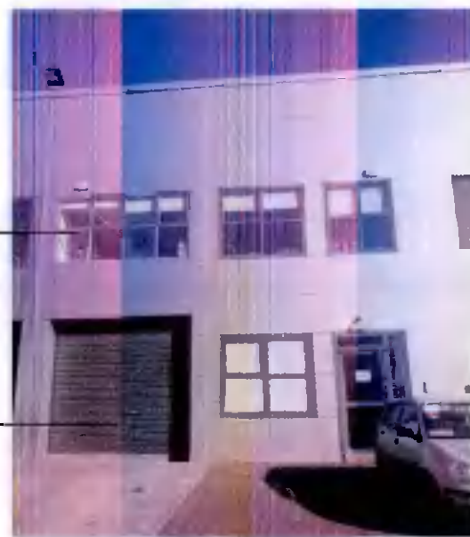
PROPOSED FRONT PHOTOGRAPH

EXISTING ROLLER SHUTTER DOOR HEIGHT REDUCED