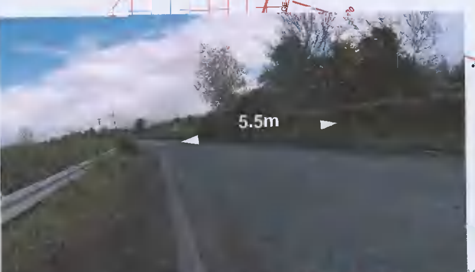
P13 PHOTO: COUNTRY RD CH_25m