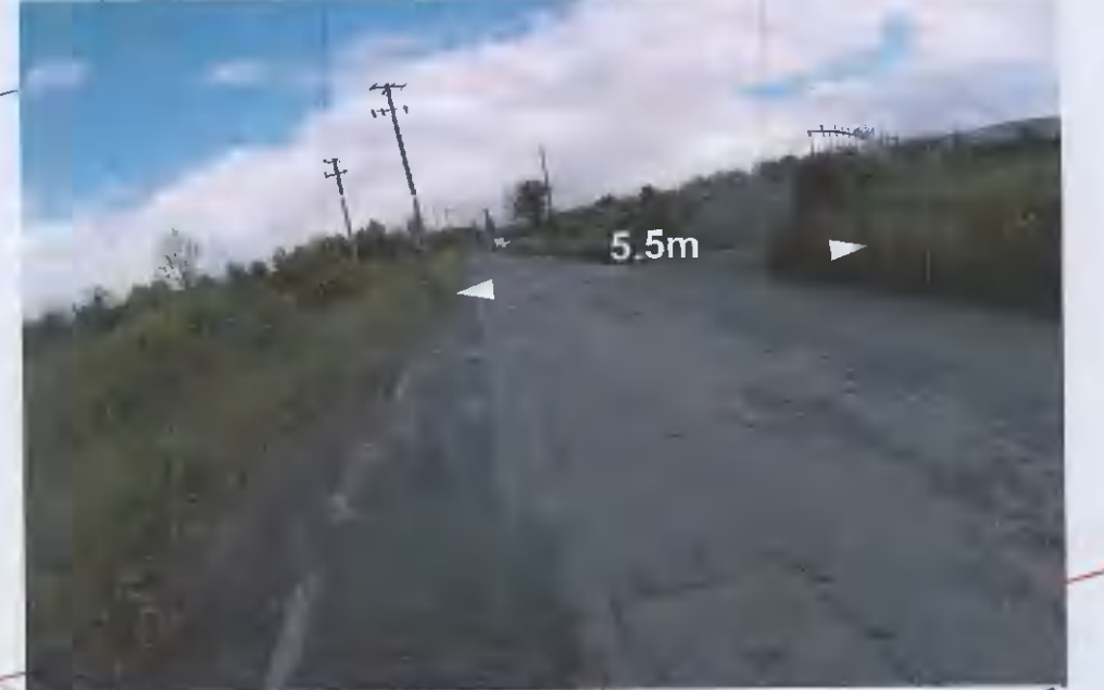
P15 PHOTO: COUNTRY RD CH_100m