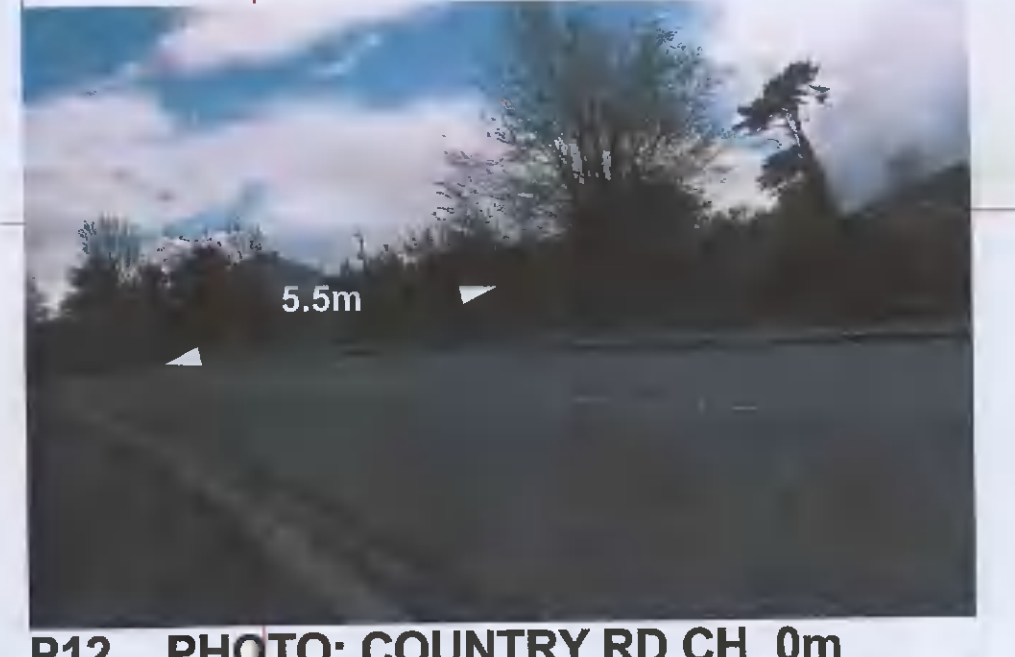
P12 PHOTO: COUNTRY RD CH_0m