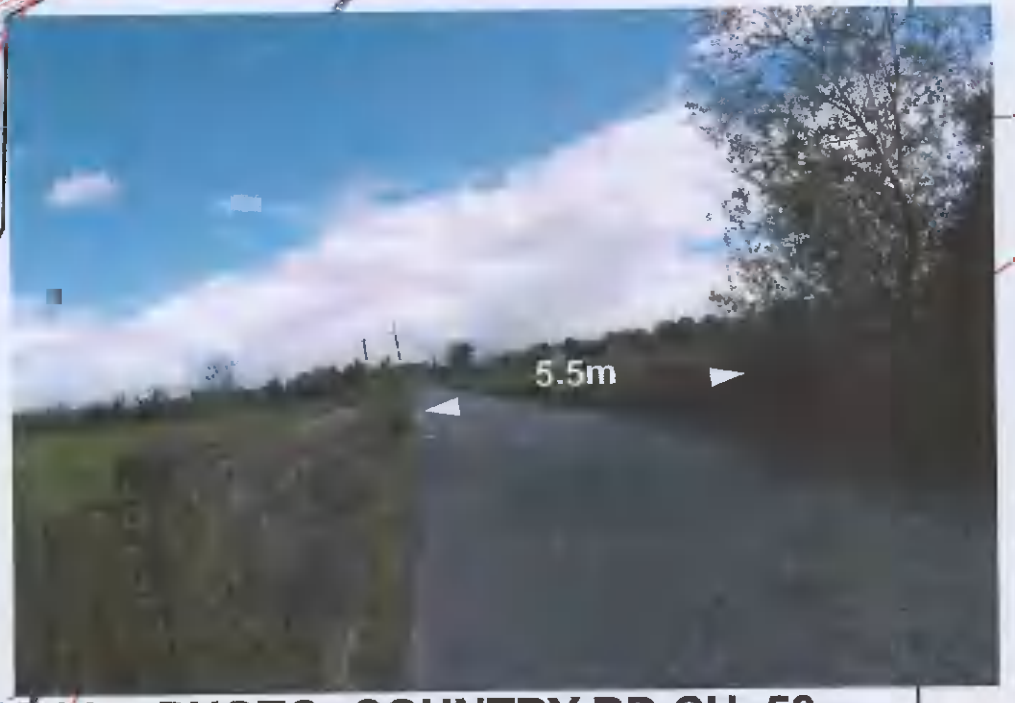
P14 PHOTO: COUNTRY RD CH_50m