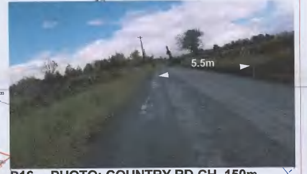
P16 PHOTO: COUNTRY RD CH_150m