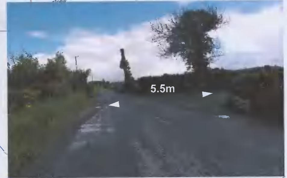
P17 PHOTO: COUNTRY RD CH_175m