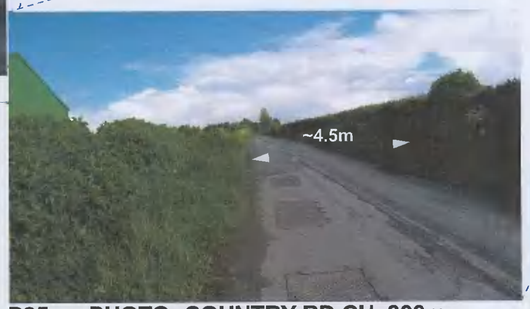
P25 PHOTO: COUNTRY RD CH_300m