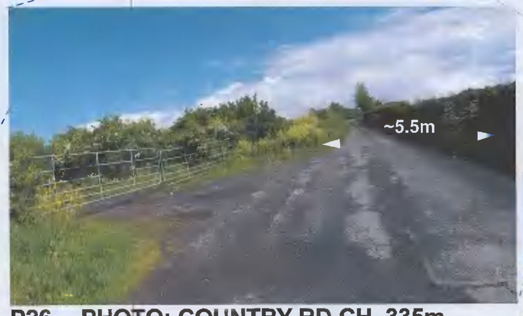
P26 PHOTO: COUNTRY RD CH_335m