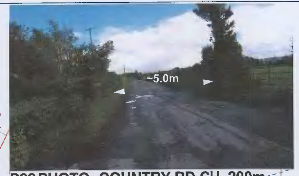
P22 PHOTO: COUNTRY RD CH_200m