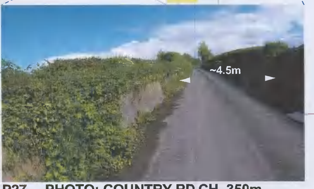
P27 PHOTO: COUNTRY RD CH_350m