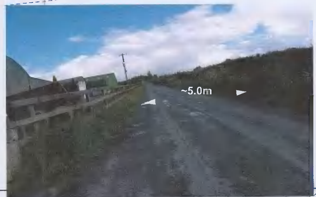
P23 PHOTO: COUNTRY RD CH_235m