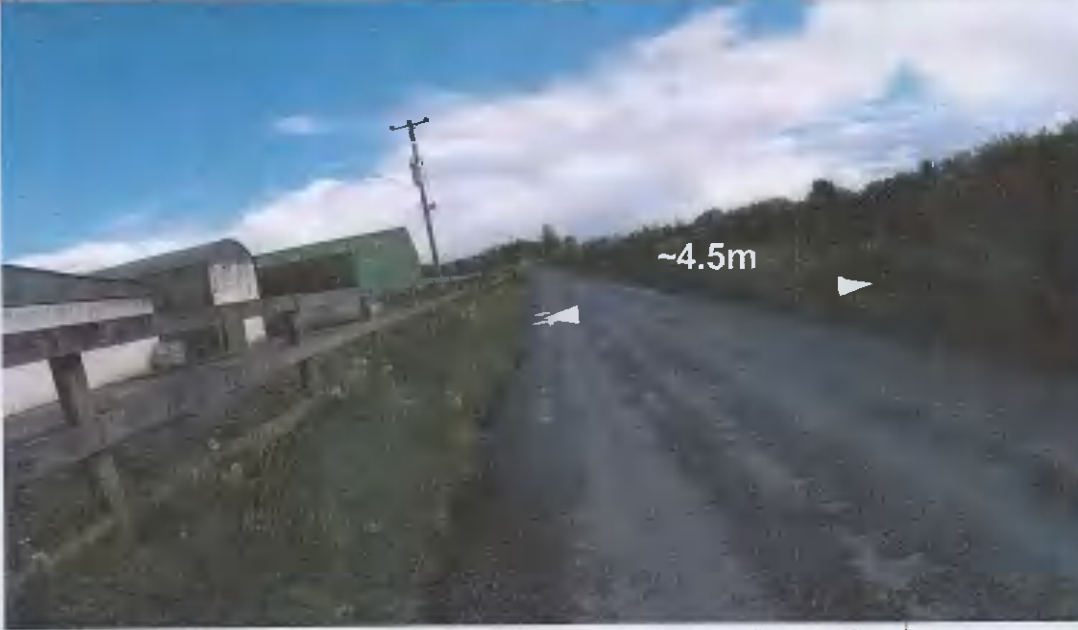
P24 PHOTO: COUNTRY RD CH_250m