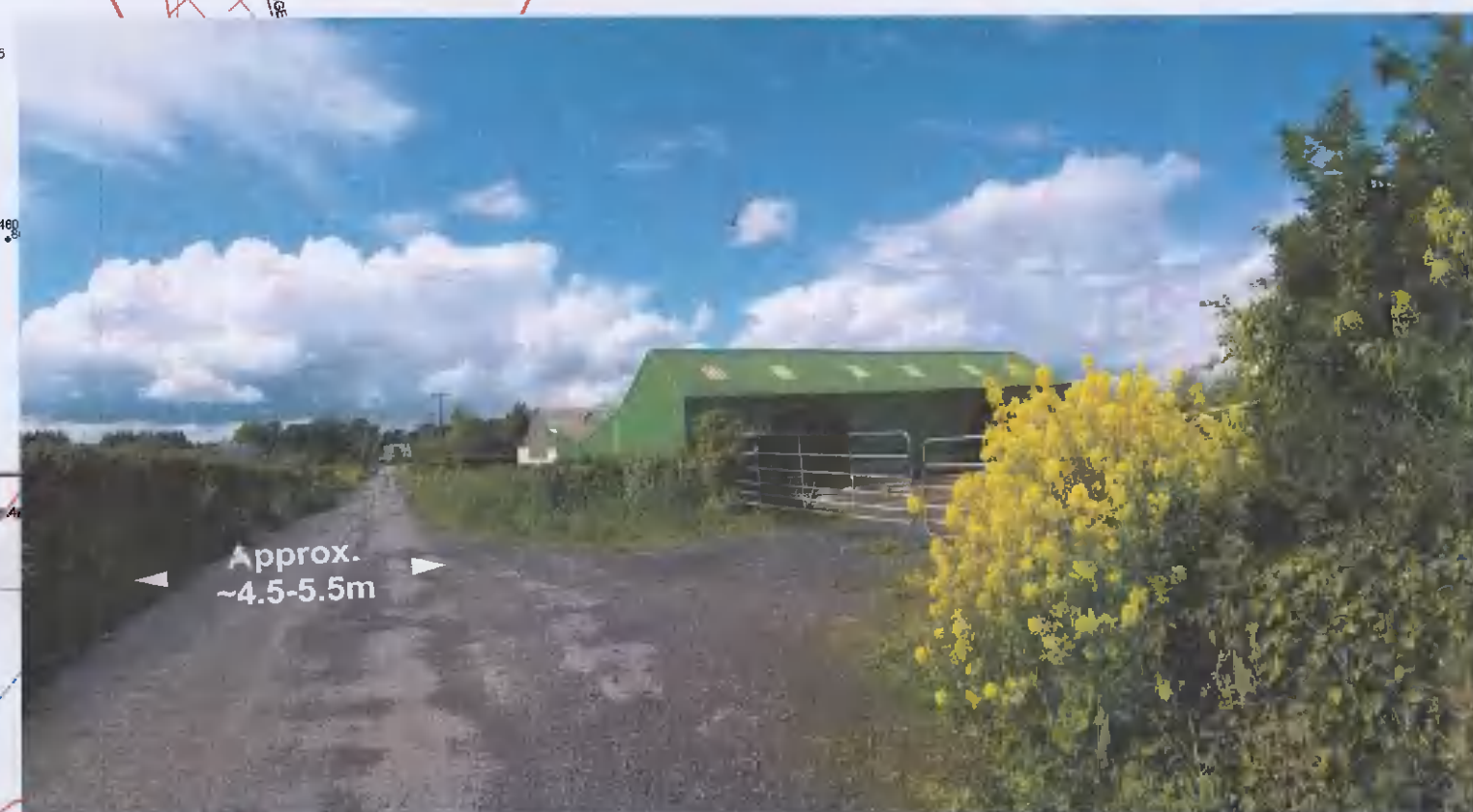
P28 PHOTO: SIGHTLINE NEW ENTRANCE (NOTE: ROAD CHAINAGE -CH_350m FROM DRAWING CHAINAGE START-POINT)