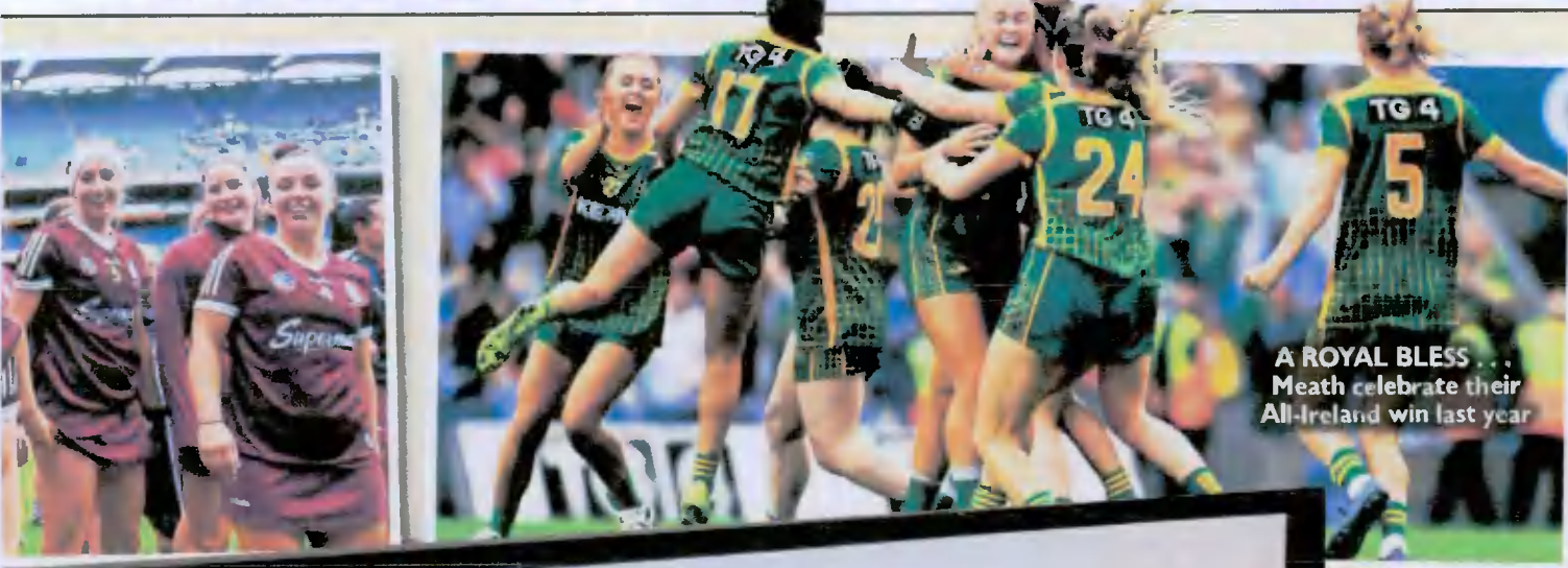
A ROYAL BLESS... Meath celebrate their All-Ireland win last year

KERRY legend Marc Ó Sé is backing Kildare to pile on the misery for Dublin on Sunday.