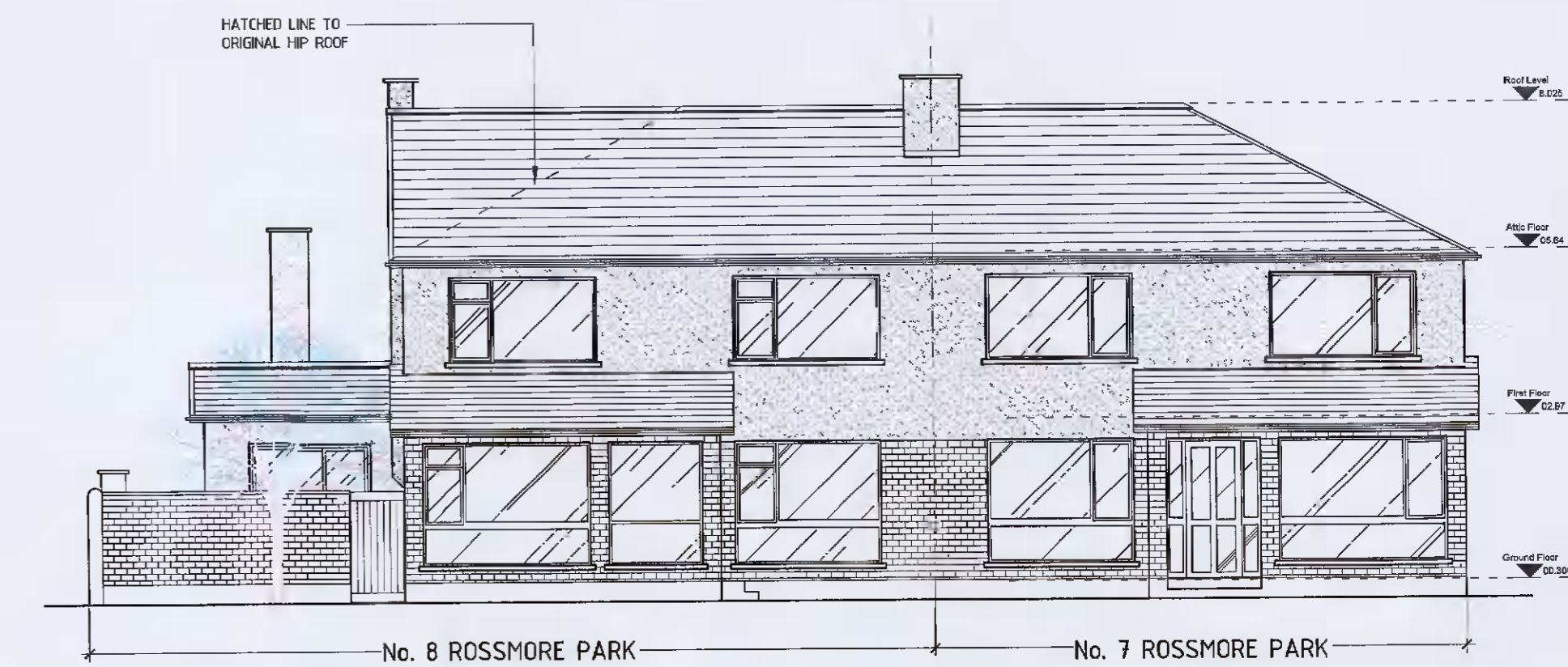
03 PROPOSED CONTIGUOUS ELEVATION SCALE 1:50