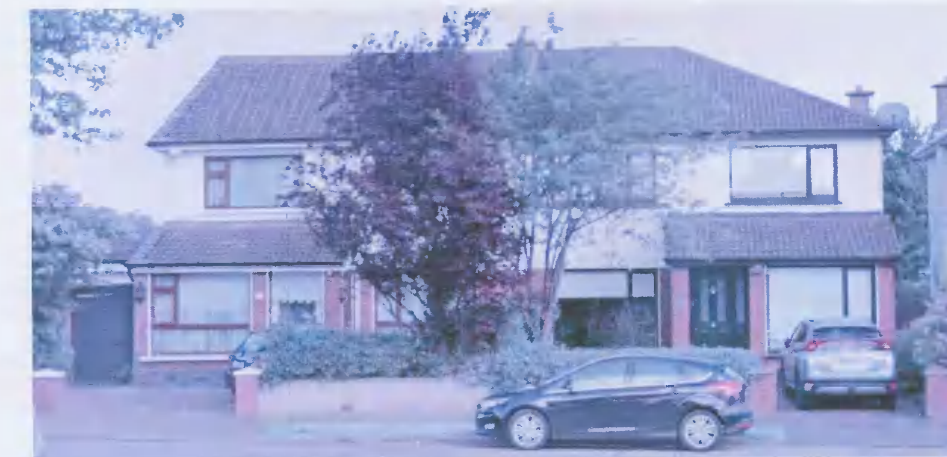
04 PROPOSED (MOCK-UP) CONTIGUOUS ELEVATION SCALE 1:6