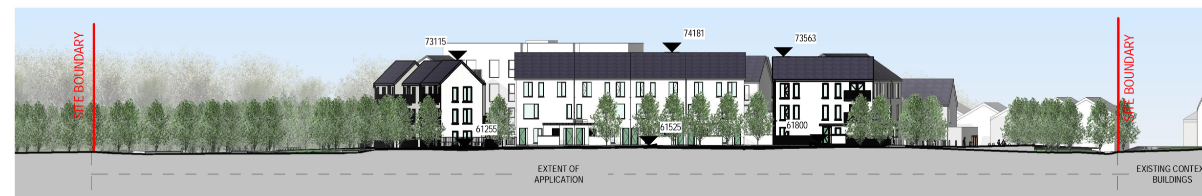
⑦ Site Section B Scale: 1 : 500