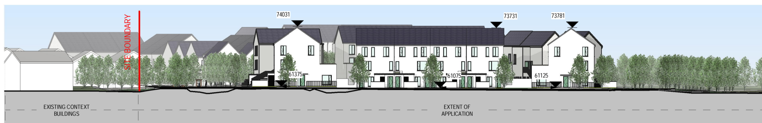
⑧ Site Section C Scale: 1 : 500