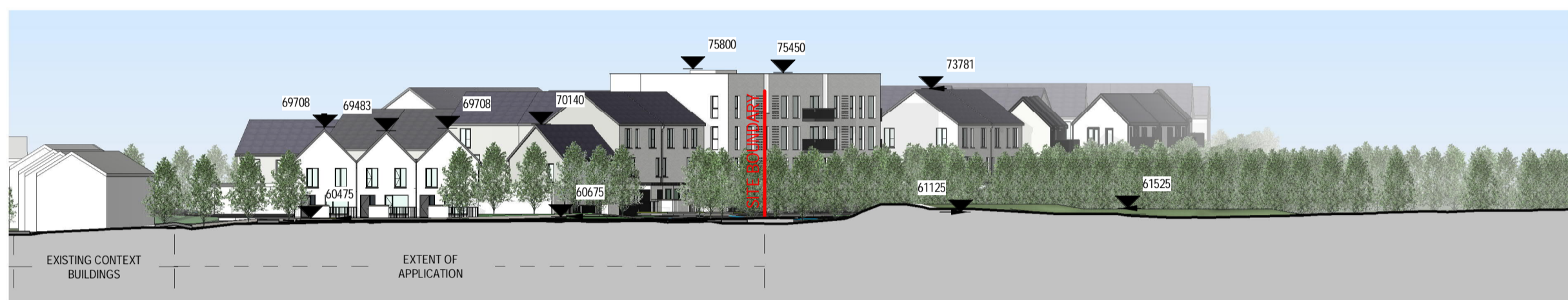
④ Contiguous Elevation 4 Scale: 1 : 500