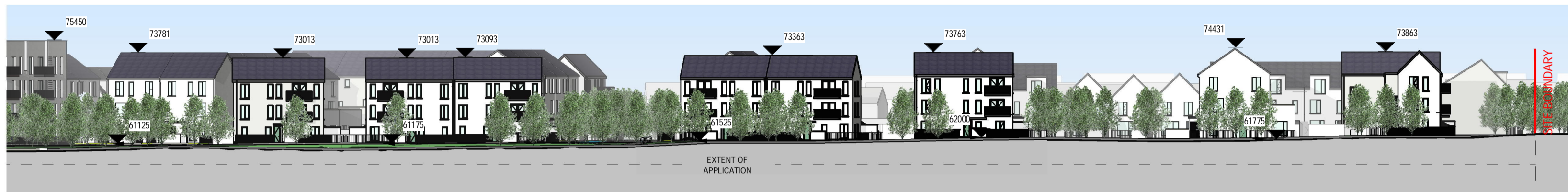
② Contiguous Elevation 2 Scale: 1 : 500