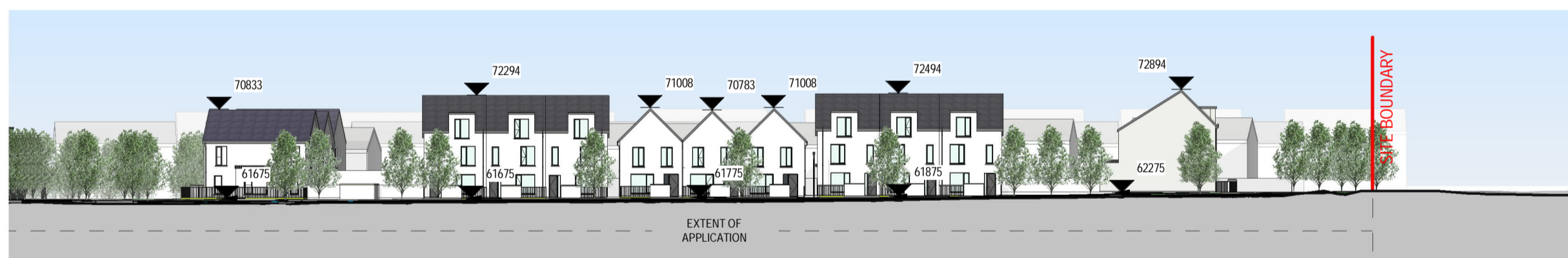
⑥ Site Section A Scale: 1 : 500