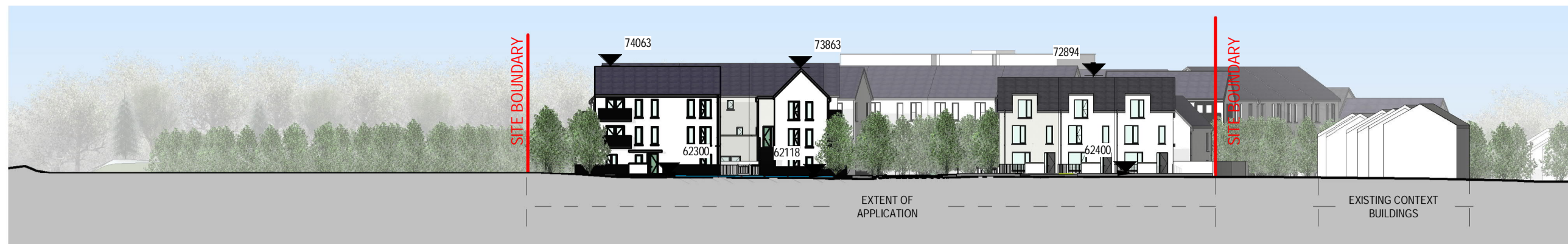
① Contiguous Elevation 1 Scale: 1 : 500