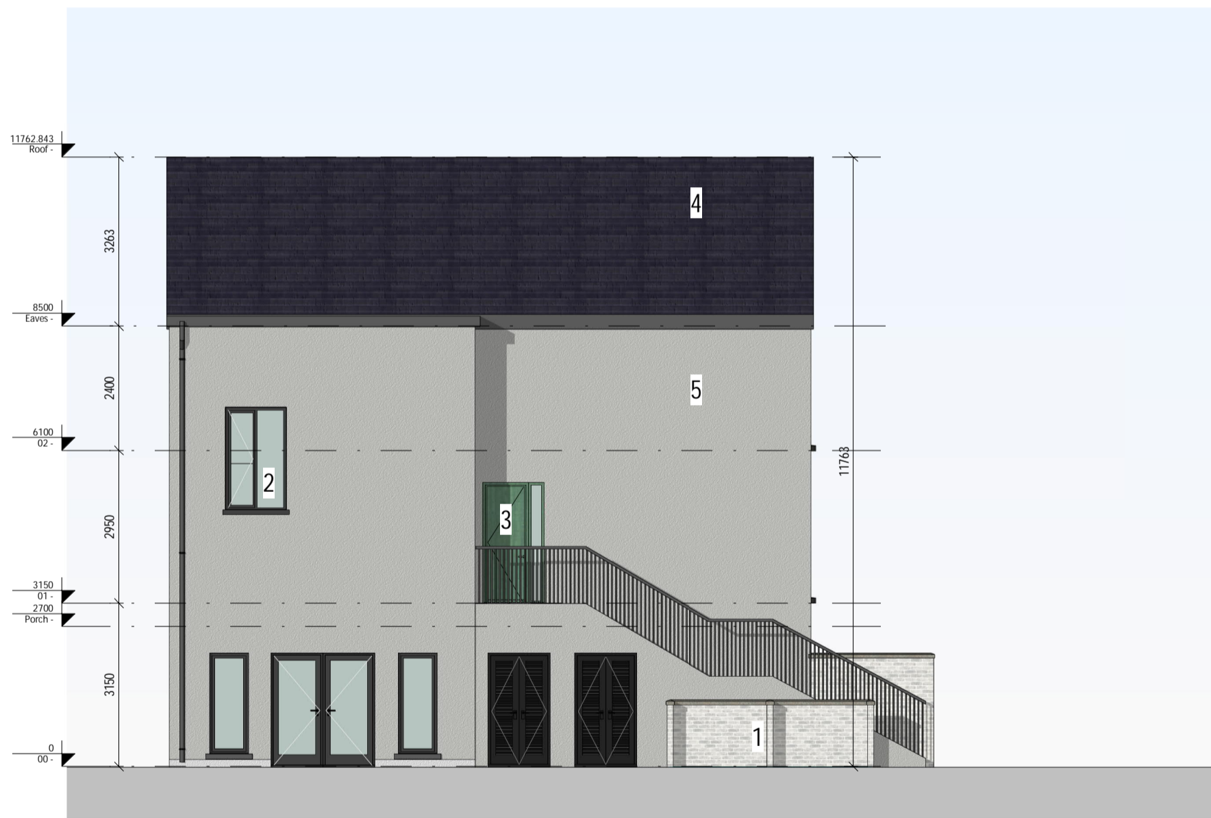
4 Rear Elevation Scale: 1 : 100