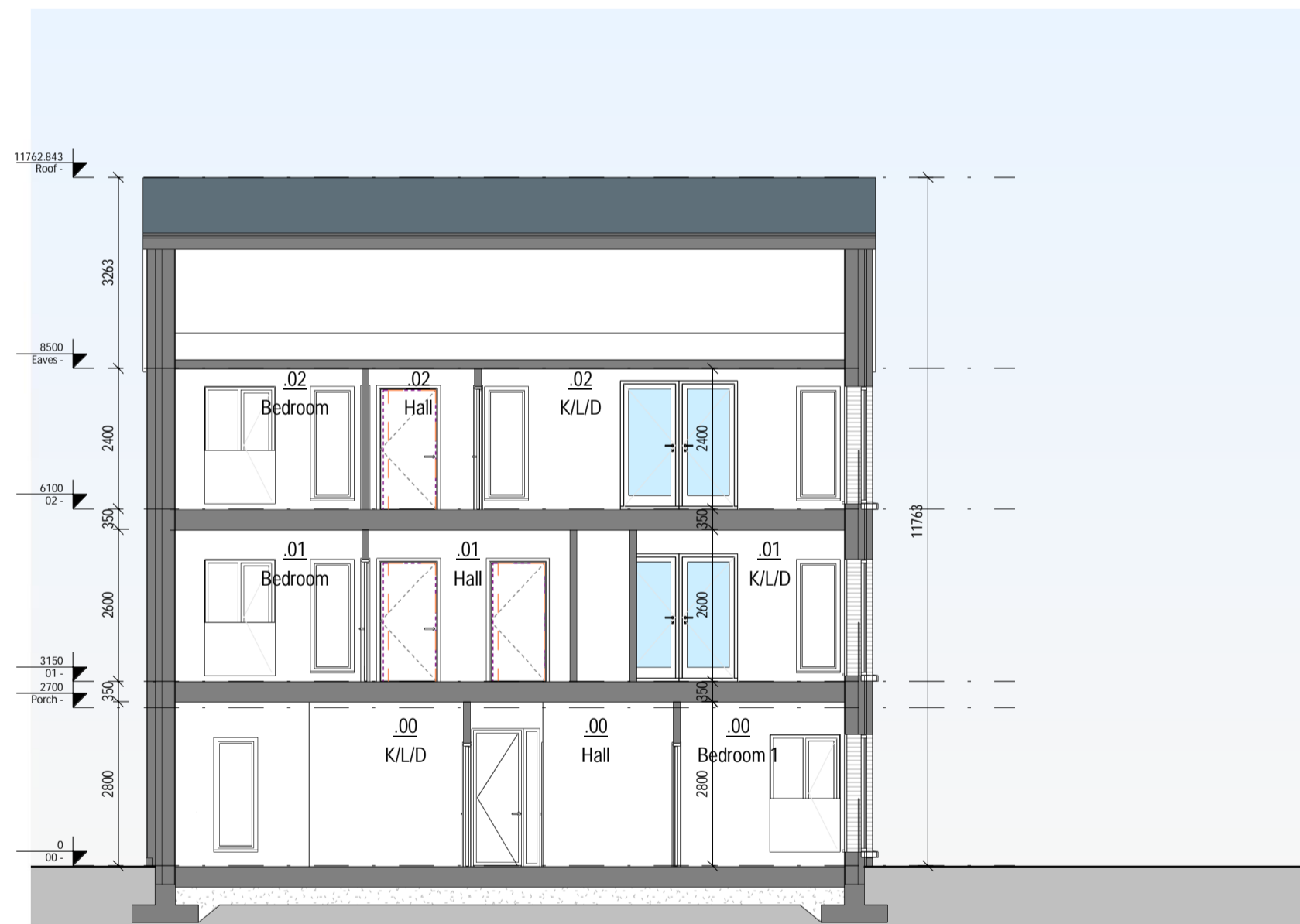
5 Section A-A Scale: 1 : 100