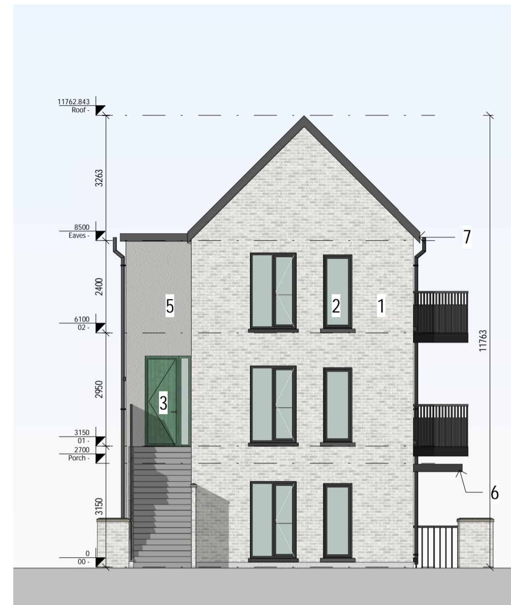
3 Side Elevation A Scale: 1 : 100