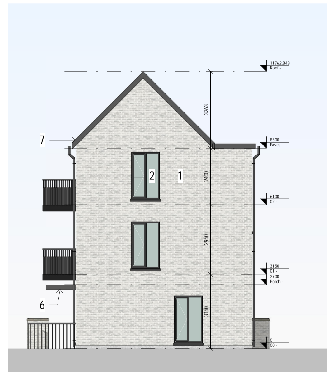
1 Side Elevation B Scale: 1 : 100