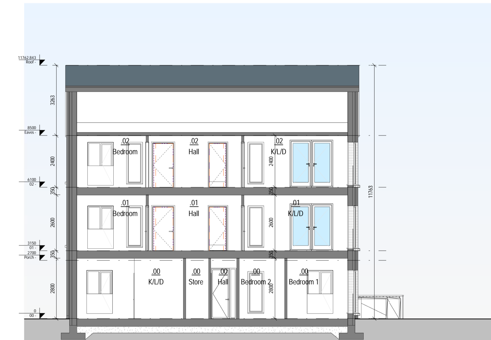
5 Section A-A Scale: 1 : 100