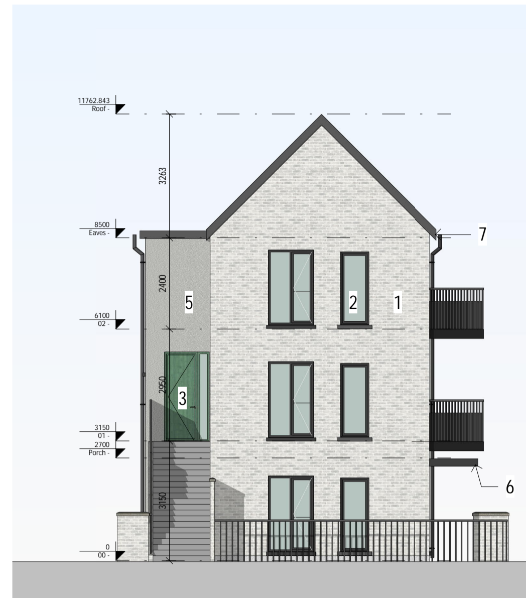
3 Side Elevation A Scale: 1 : 100