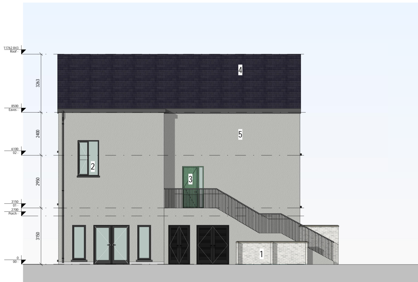
4 Rear Elevation Scale: 1 : 100