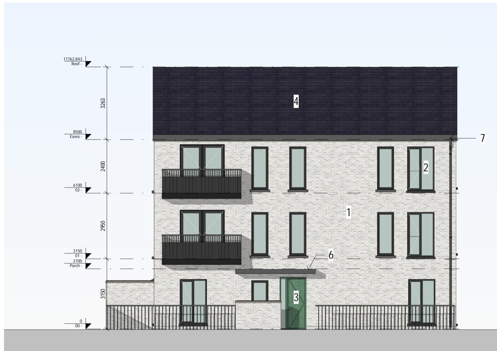
2 Front Elevation Scale: 1 : 100