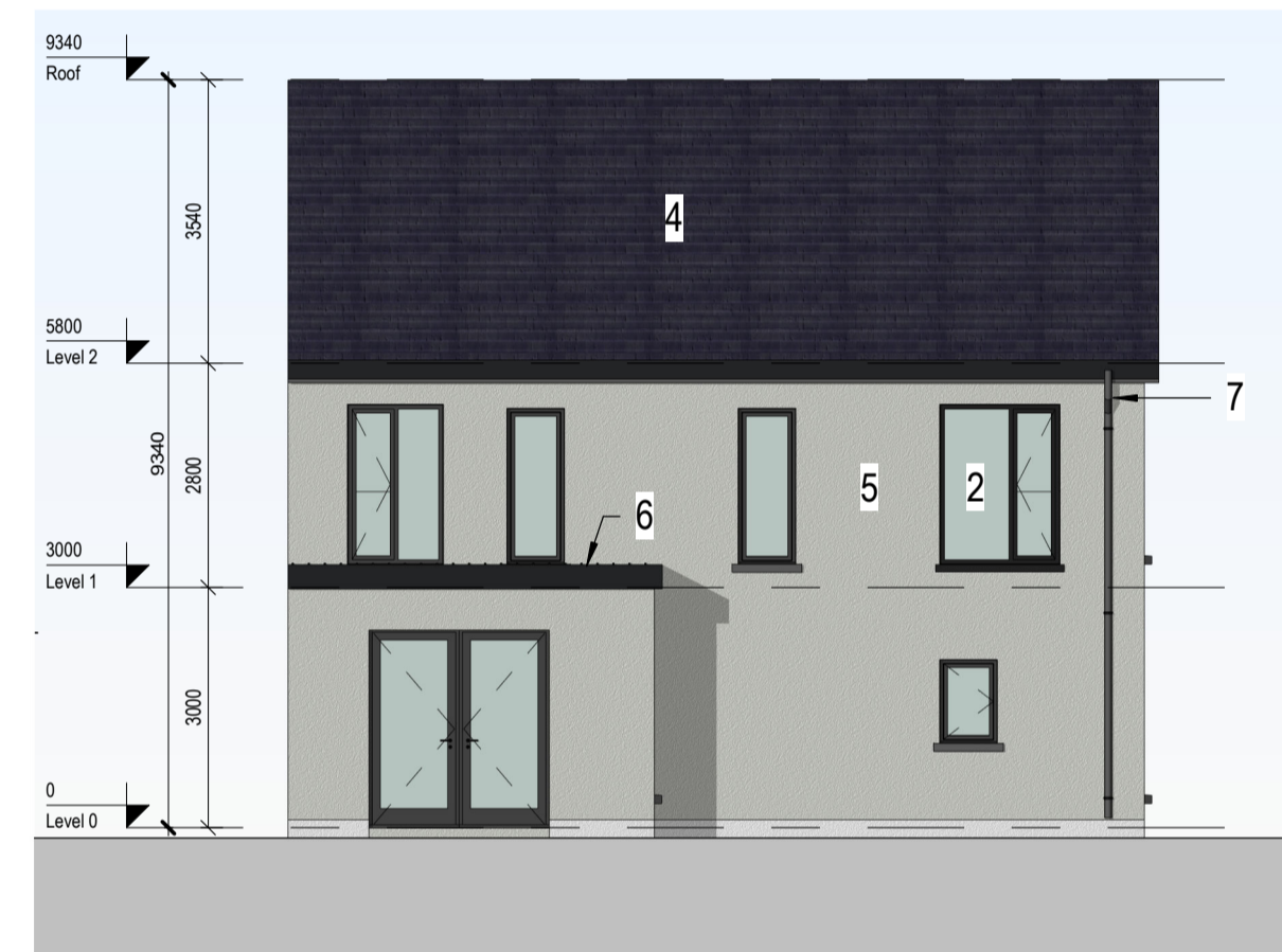
6 Rear Elevation Scale: 1 : 100