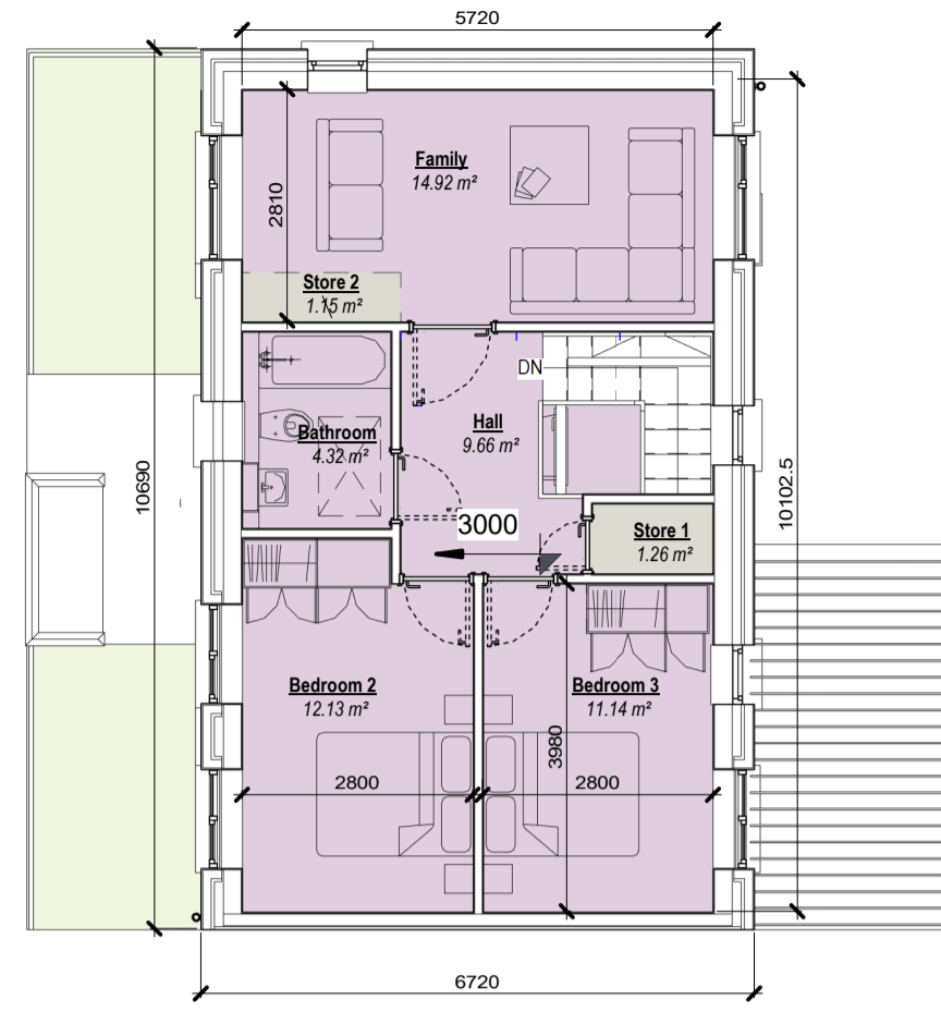
2 Level 01 Scale: 1 : 100