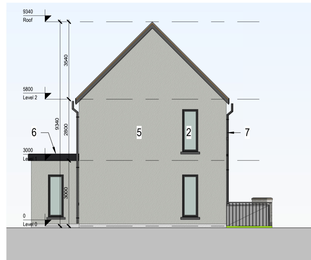
5 Side Elevation A Scale: 1 : 100