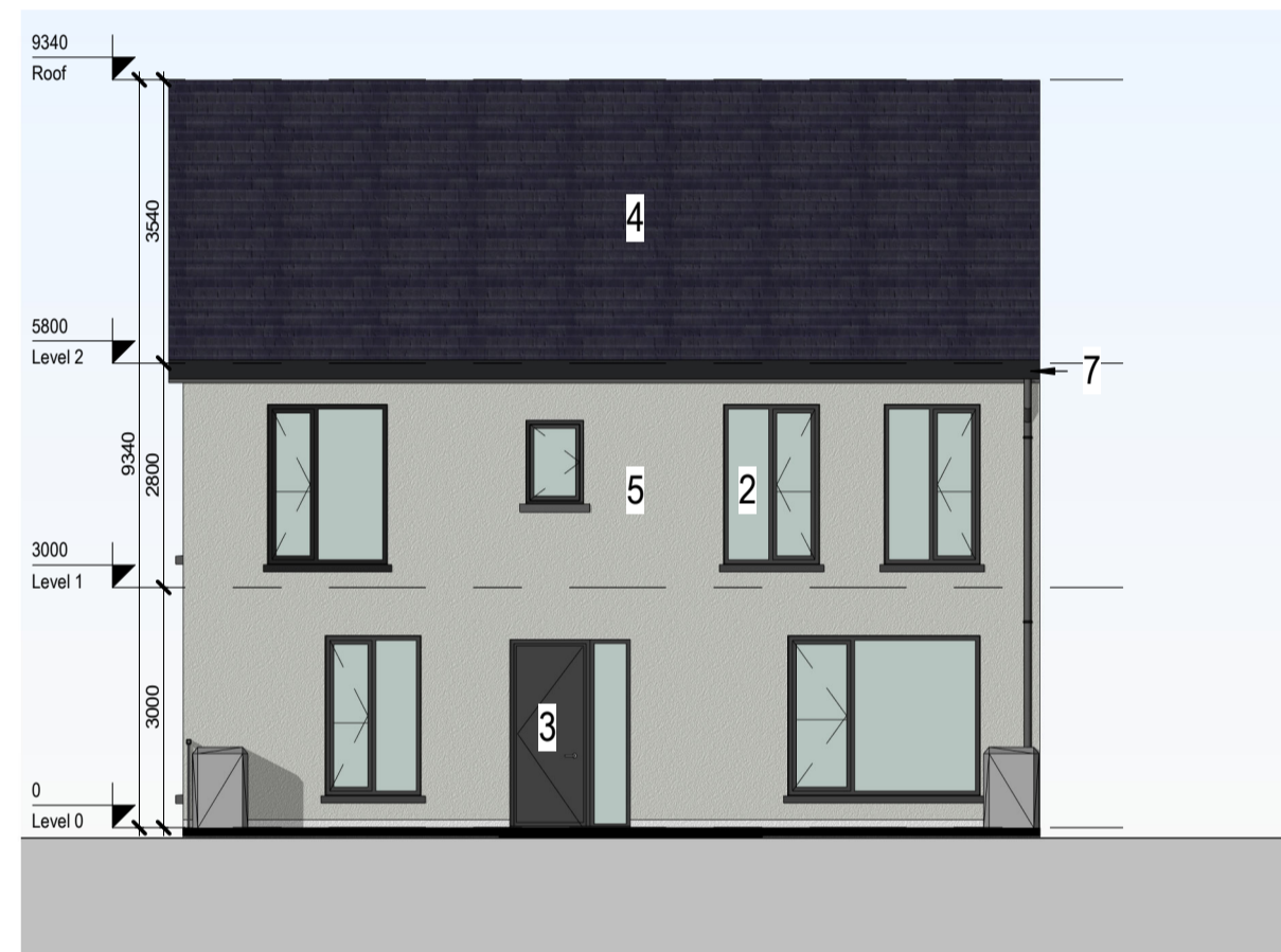
4 Front Elevation Scale: 1 : 100