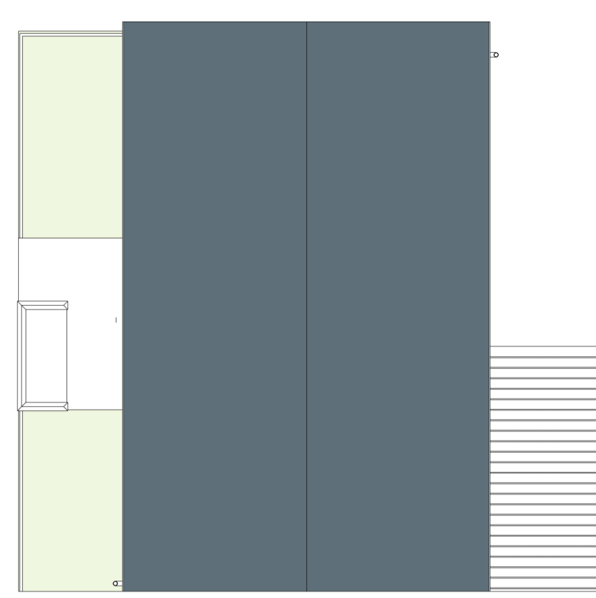
3 Roof Level Scale: 1 : 100