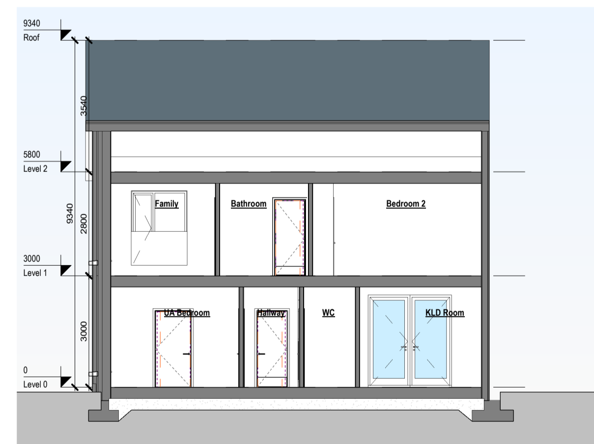
9 Section A-A Scale: 1 : 100