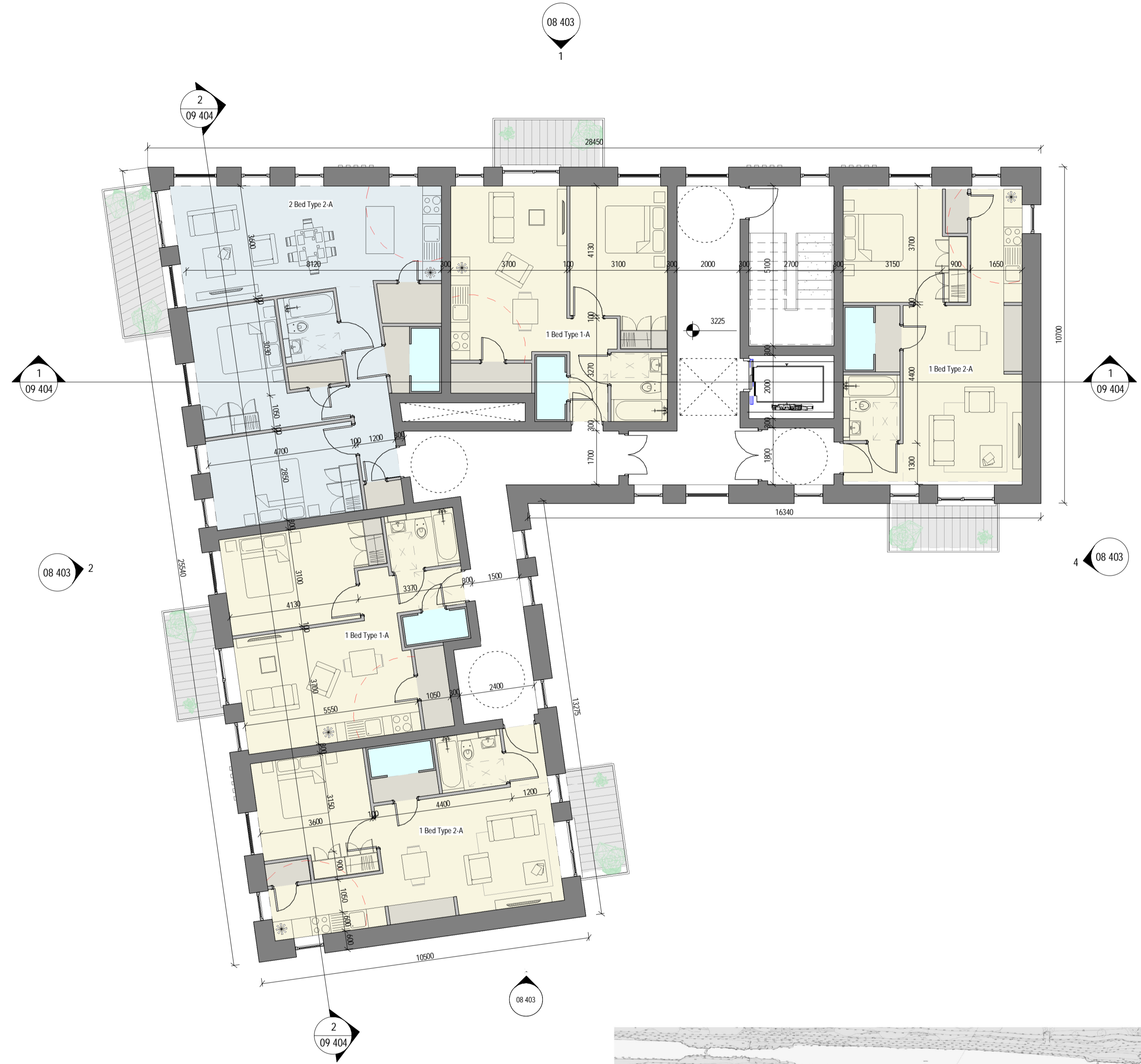
2 01 - First and Second Floor Scale: 1 : 100