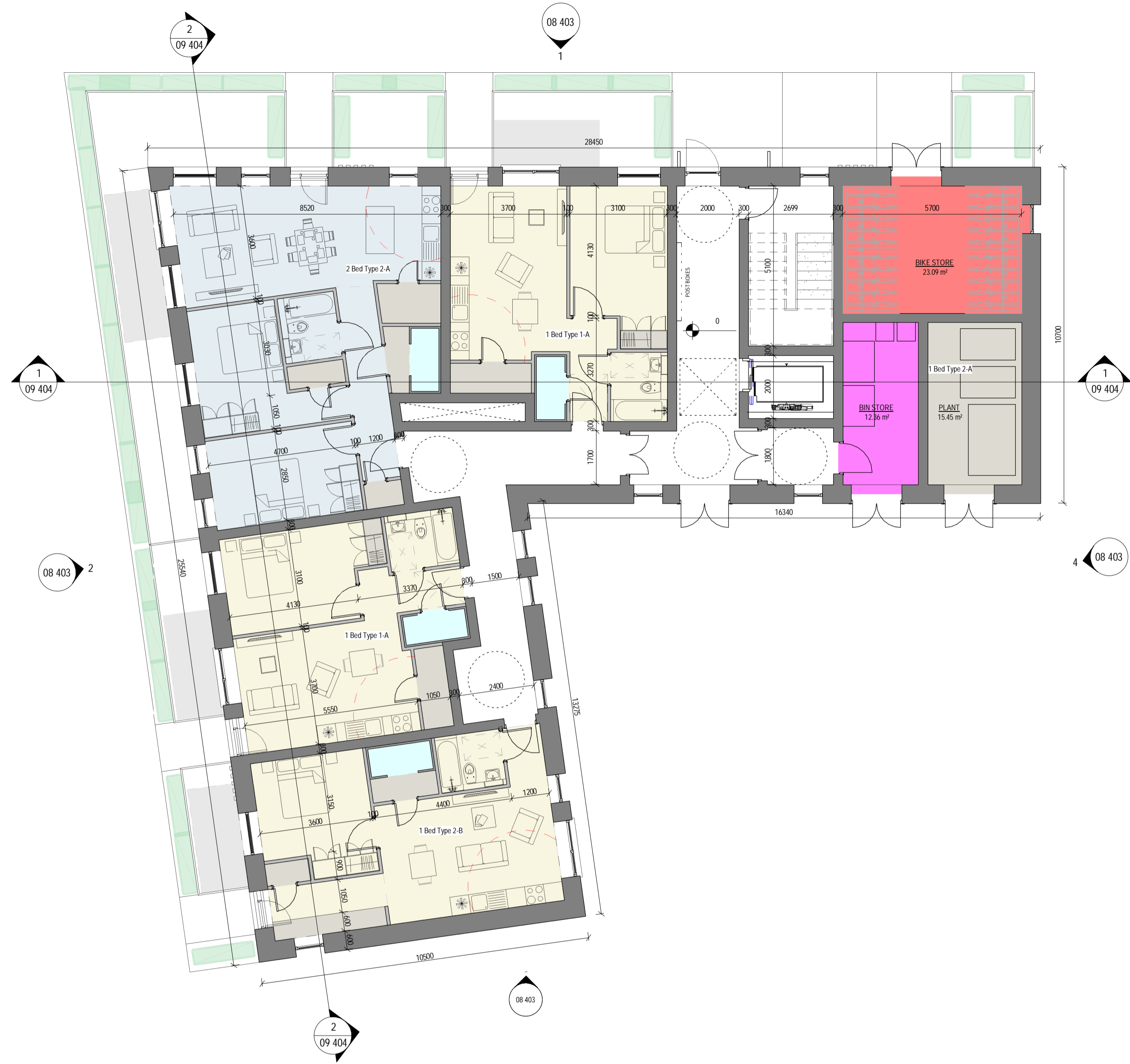
1 00 - Ground Floor Scale: 1 : 100