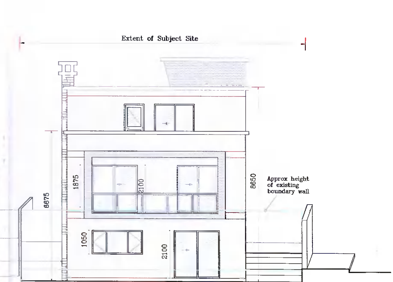
Hollingsworth Rear Elevation/Site Section scale 1:100

NOTES : This drawing is copyright and may not be copied without written permission of ACT. Use only figured dimensions. Do not scale this drawing to obtain measurements. The contractor is responsible for and must check all dimensions on site. The Architects are to be notified of any discrepancies prior to that work commencing. The Architects make every effort to ensure accurate information is given out however, we are human also and mistakes can be made please check all drawings issued.