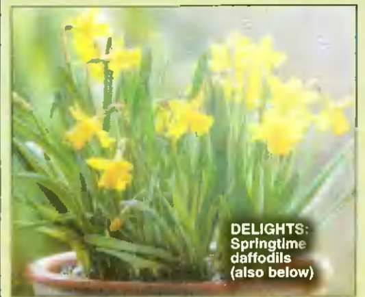
DELIGHTS: Springtime daffodils (also below)