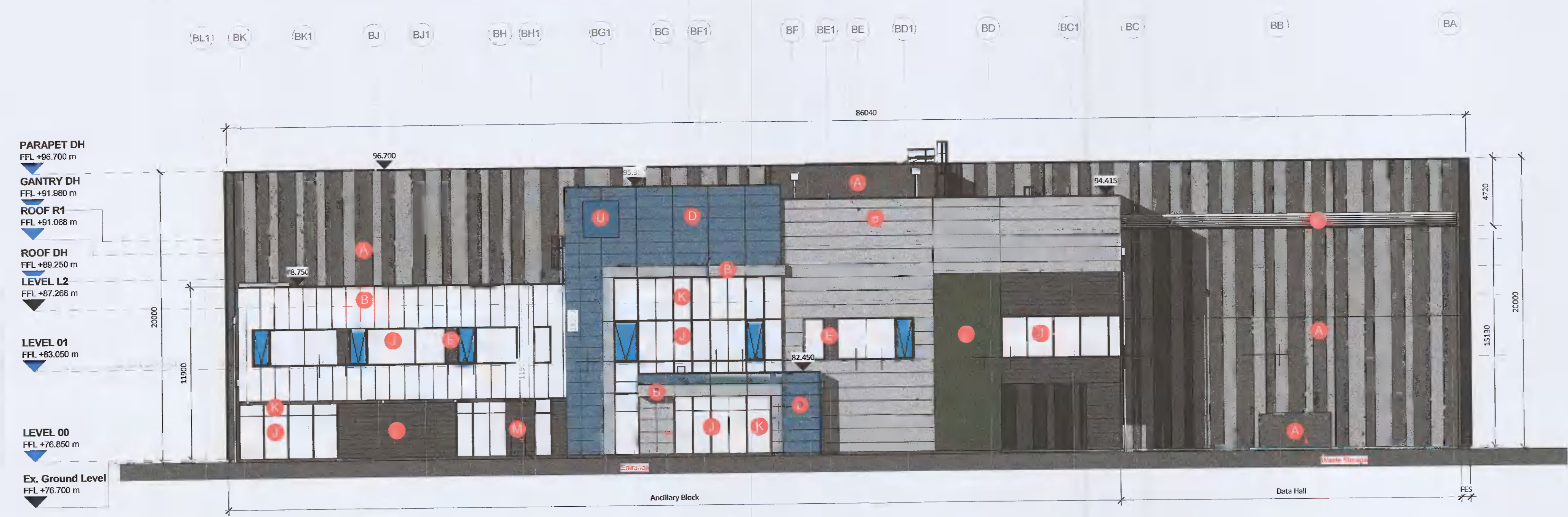
1 04052 DUB16 North Elevation 1 : 200

All dimensions to be checked on site. Figure dimensions take preference over scaled dimensions. Any errors or discrepancies to be reported to the Architects. If the drawing may not be edited or modified by the recipient. Copyright and ownership of this drawing is vested in RKD Architects, whose prior written consent is required for its use, reproduction or for publication to any third party. All rights reserved by the law of copyright and by international copyright conventions are reserved to RKD Architects and may be protected by court proceedings for damages and/or reparations and costs. RKD Architects' Quality Management Systems are certified to ISO 9001:2015.