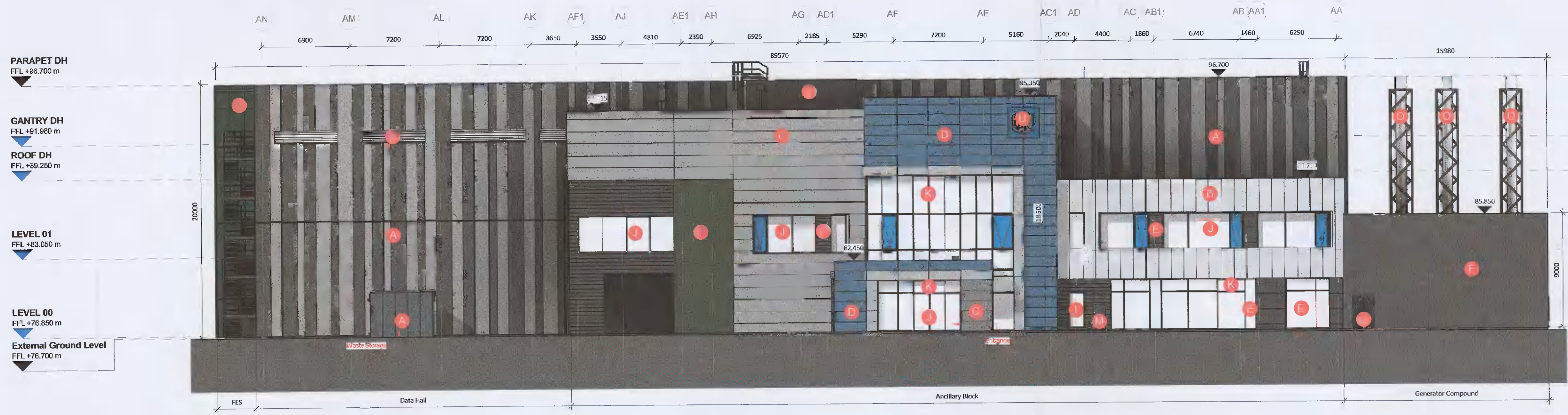
1 04012 DUB15 - North Elevation 1 : 200

All dimensions to be checked on site. Figured dimensions take preference over scaled dimensions. Any errors or discrepancies to be reported to the Architect. This drawing may not be edited or modified by the recipient. Copyright and ownership of this drawing is vested in RKD Architects, whose prior written consent is required for its use, reproduction or for publication to any third party. All rights reserved by the law of copyright and by international copyright conventions are reserved to RKD Architects and may be protected by court proceedings for damages and/or injunctions and costs. RKD Architects' Quality Management Systems are certified to ISO 9001:2015.