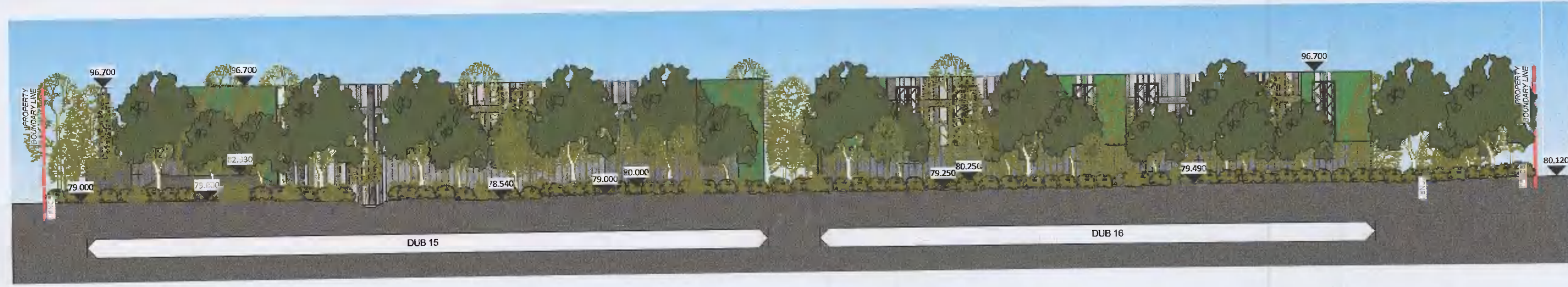
3 04006 Proposed Contiguous South Elevation 03 1 : 500