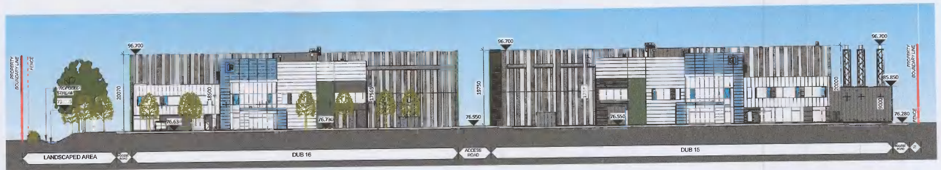
1 04006 Proposed Contiguous North Elevation 02 1 : 500