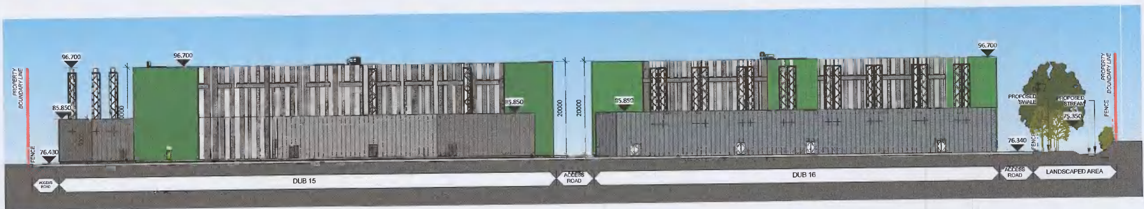
2 04006 Proposed Contiguous South Elevation 03 1 : 500