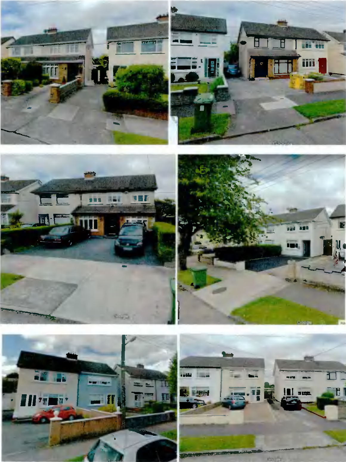
Examples of similar front elevational layouts within "Castle" estate.