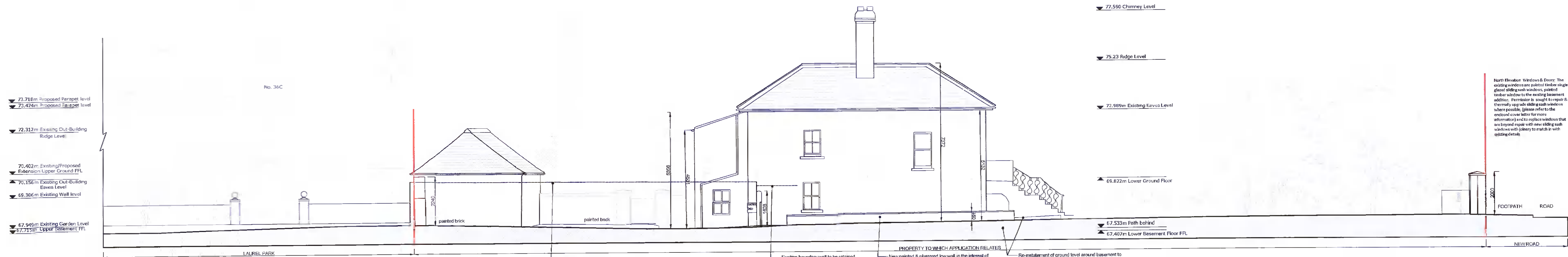
PROPOSED NORTH (SIDE) CONTEXTUAL ELEVATION